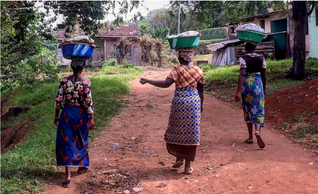
Figure 2. Women walking in the Mwanza region, Tanzania. We estimate that approximately one third of adolescent girls and young women marry under 18 years in the study area, meeting the definition of ‘child marriage’.

population with urbanisation, now matching or even exceeding boys’ education (Hedges et al. 2018). While schooling reduces farm and household work, this is truer for boys; girls who attend school still contribute substantially to domestic chores, effectively taking on a ‘double shift’ of school and domestic work, reducing their time allocation to leisure (Hedges et al. 2018).