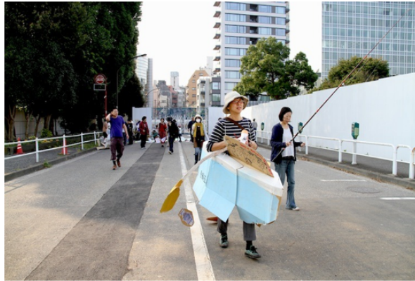
The “Han-Orinpikku Ran-ran-ran” parodic sports festival around the New National Stadium and Meiji Park area on October 12, 2015.

action seemed to encapsulate the casual equilibrium of declamatory and ludic.