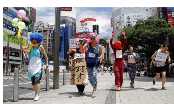
“Han-ran” running event in Shinjuku on July 2013.

The group continued this style of comic and inventive protest action with two fake sports events. Held in July 2013, the first was the “Han-ran” (a pun on hanran , meaning rebellion, but also meant as “anti-run,” specifically mocking the 2020 organizers’ “day runs”), which saw participants in colorful costumes festooned with anti-2020 paraphernalia, running in the pedestrianized zone in Shinjuku as a tongue-in-cheek version of a race. One runner was dressed as Adolf Hitler, in an apparent nod to the 1936 Berlin Games.