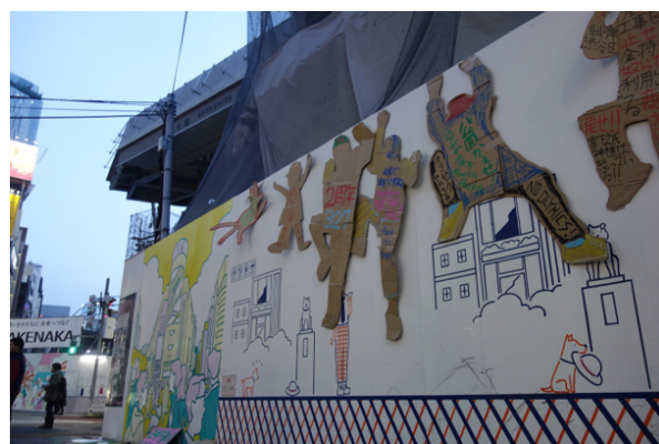
The Miyashita Park construction site hoarding was again “hijacked” in March 2019 with cardboard figures with anti-Olympics slogans.

shopping complex. Miyashita Park was another example, at one point its fencing decorated with a mural called “A day in the life [of] Shibuya” that presented Shibuya’s image of itself as a diverse and liberal place through a young girl’s encounters with the ward’s citizens (including a male same-sex couple, people with disabilities, and the elderly). It is a showcase of diversity but a very bourgeois one that has no room for the homeless or certain marginalized groups. In March 2019, activists from Miyashita Kōen Neru Kaigi protested the closure of the park and the coopting of the fencing to legitimize the gentrification in Shibuya by attaching their own cardboard figures decorated with messages. At a glance, these figures seemed to be climbing up the hoarding as if trying to get back inside the park. This tactic of adding cardboard art objects to fencing has been employed regularly by activists to protest park closures at night, not only Miyashita Park.