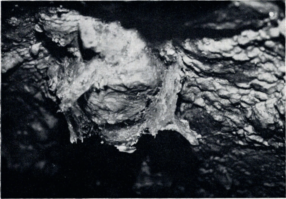
Fig. 4. Detail of one of the protuberances containing a rock fragment (10 cm long) at the ceiling of the subglacial cavity. Ice accretions can be observed between the rock fragment expelled from the glacier ice and the frozen mud layer which is plastered at the base of the glacier.

and alkaline-earth elements had been established in the laboratory. The samples were manipulated with clean polyethylene gloves—a new pair of gloves was used for each sample—and transferred into polyethylene containers which had been cleaned in the laboratory with a mixture of chemically pure nitric acid and detergent and then copiously rinsed with distilled water. The tightly closed polyethylene containers were placed in a thermally isolated box and then transferred to a room adjacent to the subglacial cavity for processing.