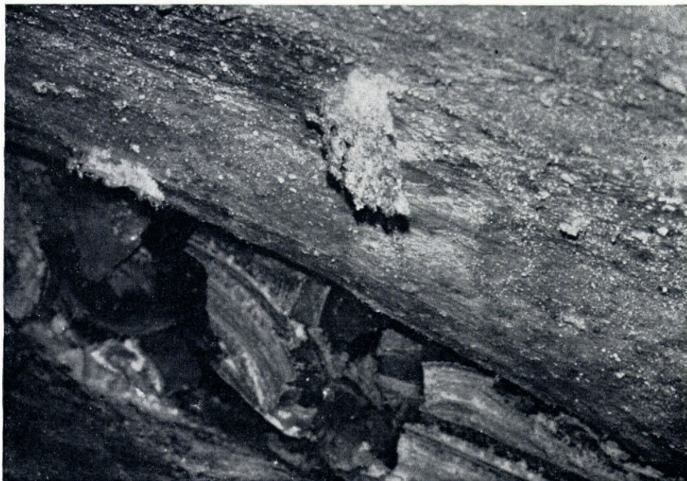
Fig. 2. Ice accretions hanging from the ceiling of the subglacial cavity. Glacier flow from left to right.