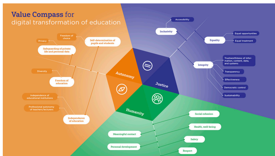
FIGURE 13.3 The value compass 92

This common language aims to elicit a discussion that transcends functionalities, costs and benefits toward formulating shared ambitions for a future of digital education.