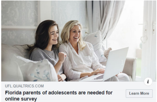
Fig. 2. Highest performing ad from Case Study 2.

Parents of adolescents are invited to participate in an online survey about social and behavioral health. e-gift card provided.