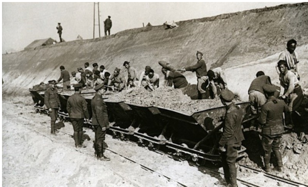
Handling ammunition was one of the many tasks the CLC performed

Building roads was a very important task for the CLC, given the need to sustain industrial warfare on a grand scale in the Western Front