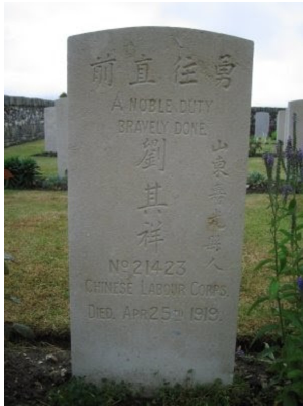
Tombstone of a CLC member, a physical reminder of their legacy

WWI, Great War, CLC, Chinese Labour Corps, Nation-Building, Versailles