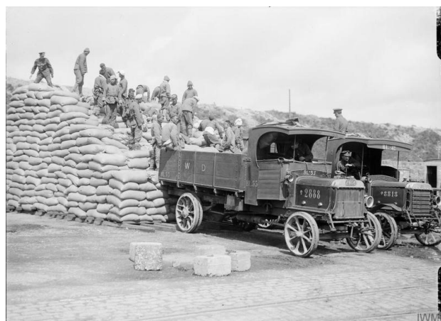
Cap badge of the Chinese Labour Corps CLC personnel moving sacks of corn at Boulogne, on 12 August 1917