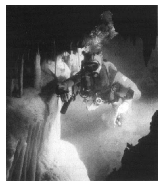
Cave diver in Blue Hole of the Bahamas. Note excellent preservation of submerged speleothems. GB-89-24-1 was found broken on the floor of the cave shown here and removed with the utmost care to preserve the unique underwater environment.

records correlated with ice-core records (see 'The 2000 Radiocarbon Varve/Comparison Issue' of Radiocarbon 43(1)). These new data confirm the fact that radiocarbon ages are consistently younger than the calendar age estimates but there remains a significant amount of scatter in the data.