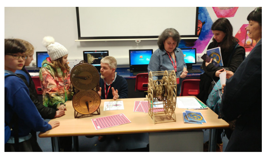
Iris Festival of Ancient and Modern Science

Year 9 Classical Civilisation Students from Cheney School, where the event was hosted, created a walk-through Pompeii exhibition, complete with an erupting volcano stall at the end, run by the Department of Earth Sciences! Year 8 Beginners Latin students created activities and displays themed on the Presocratic Philosophers.