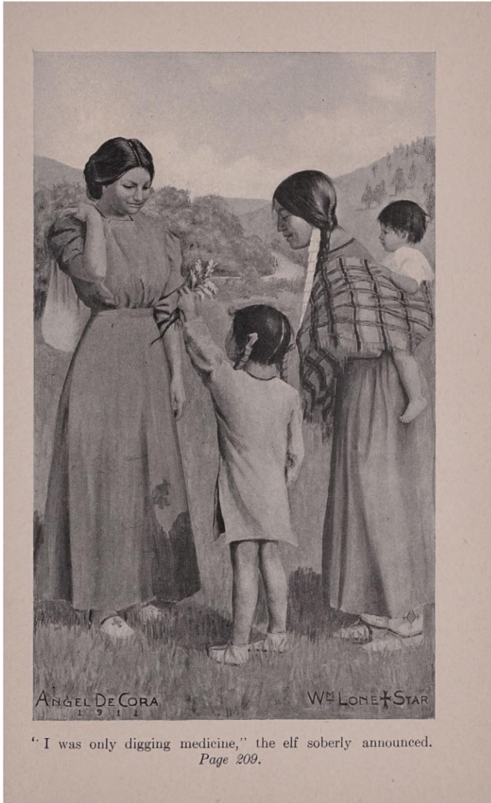
Figure 3. Yellow Star with Blue Earth's children and their mother. Elaine Goodale Eastman, Yellow Star: A Story of East and West , 1911. Illustration by Angel De Cora and William Lone Star.