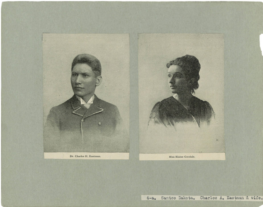
Figure 4. Dr. Charles Eastman and Elaine Goodale Eastman. Edward E. Ayer Digital Collection, Newberry Library, https://collections.carli.illinois.edu/digital/collection/nby_eeyer/id/144 (accessed March 7, 2024).

attempted lobbying to support Indigenous people but met with continued frustrations. Eventually, with encouragement and editorial support from Elaine, he found noteworthy success as a writer, publishing biographical stories initially in St. Nicholas and then in popular books such as Indian Boyhood (1902) and From the Deep Woods to Civilization (1916) (Figure 4). 61