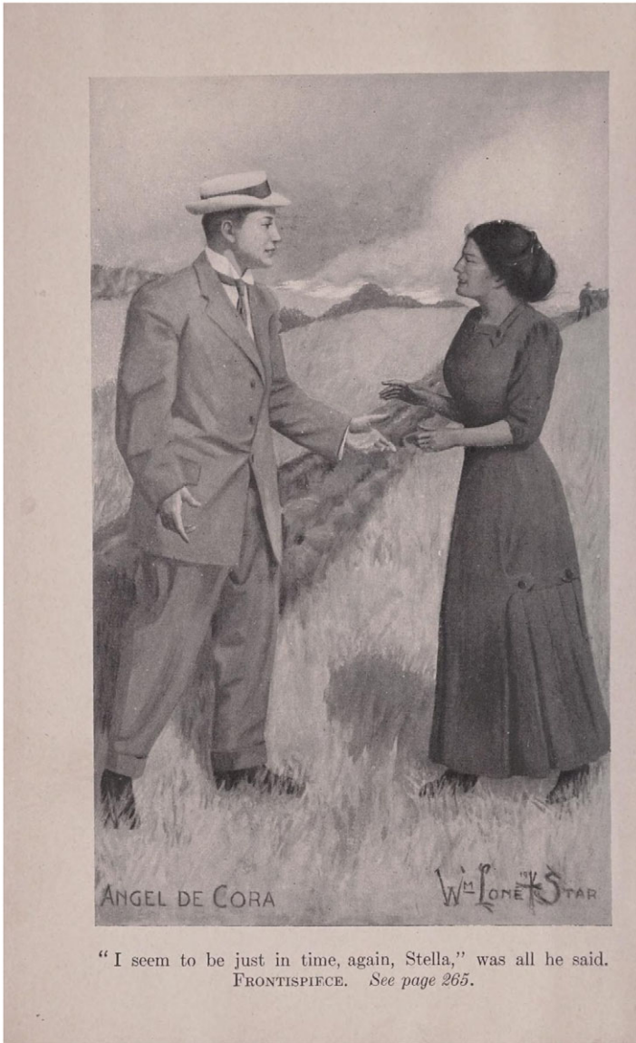
Figure 5. Frontispiece of the novel, showing New Englander Ethan Honey's journey West to visit and reconnect with his "Star." Elaine Goodale Eastman, Yellow Star: A Story of East and West , 1911. Illustration by Angel De Cora and William Lone Star.

white agent and his colleagues, and "most of all their wives, were continually saying among themselves: 'How long do you suppose she'll keep it up? Too well-dressed and too self-possessed for an Indian girl, anyway; looks as if she thought too much of herself—needs taking down a peg.'"74 Such descriptions provide one context for