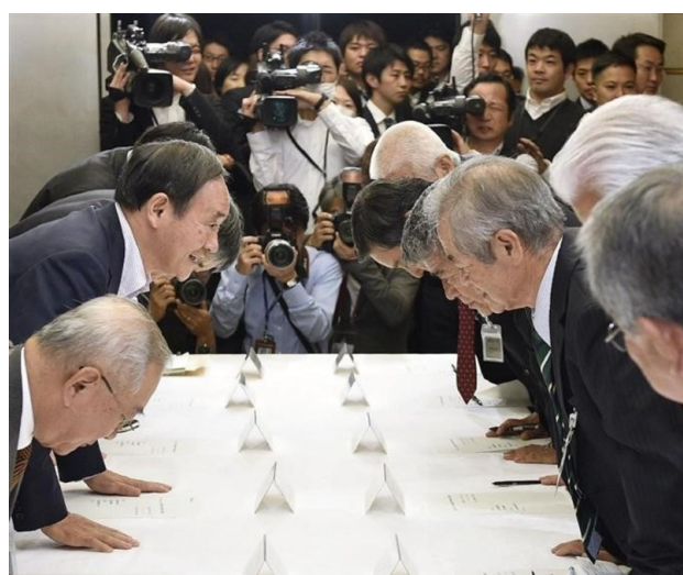
Chief Cabinet Secretary Suga (left) meets heads of the three Kube Districts, Prime Minister's office.

The ku in rural Japan and Okinawa are the very smallest administrative units, commonly based on traditional and family networks. No head of a ku had ever been invited to the Prime Minister's residence, seated at the table with top state officials like a head of state, and offered direct subsidy from state coffers.