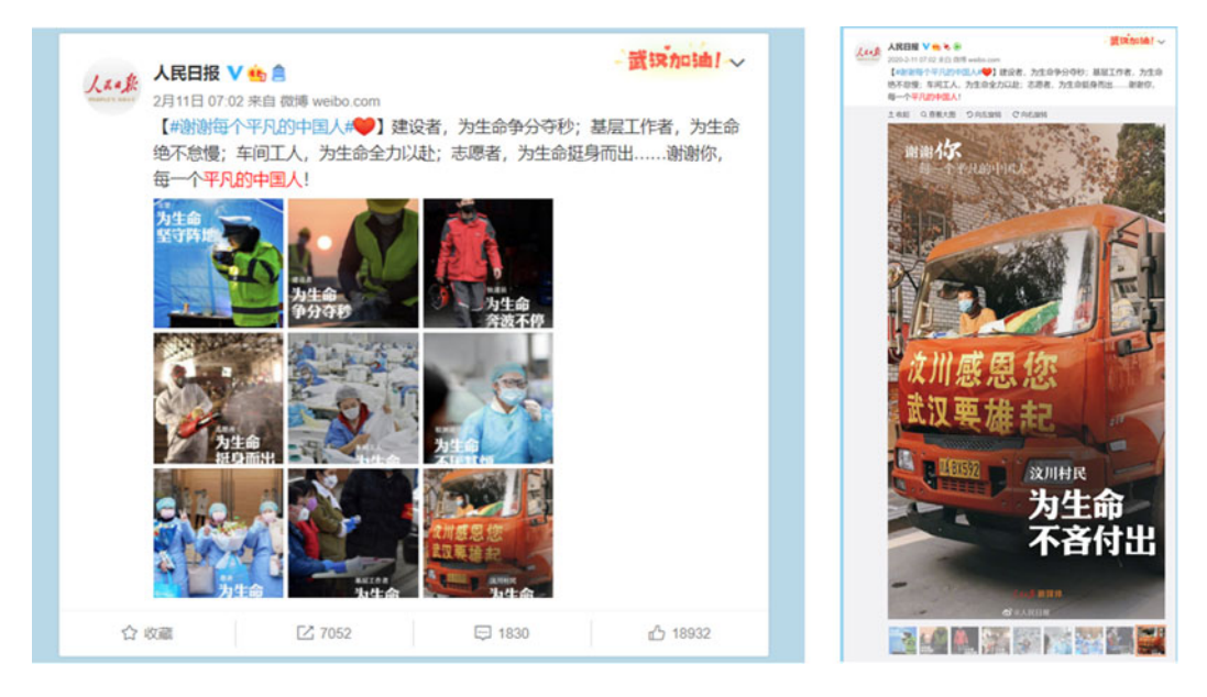
Figure 2. Left: one of a series of posts from People's Daily's Weibo campaign 'Thank You, Every Ordinary Chinese'. Right: an image from the post paying special tribute to the residents of Wenchuan.