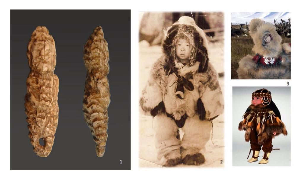
Figure 2. Ivory figurine of a child in fur coverall and ethnographic interpretations. (1) Image of child figurines from the collection of Mal'ta (State Hermitage No370/752); (2) ethnographic photo of the beginning of the twentieth century as an evidence for similar types of clothing; and (3) images of modern Chukchee doll in recent times.