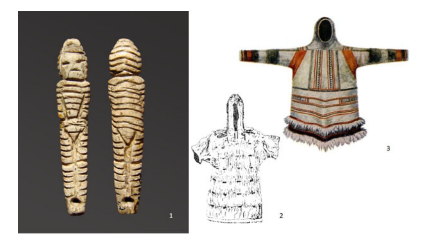
Figure 3. Ivory figurine of a child in coverall and ethnographic interpretations. (1) Images of child figurines from the collection of Mal'ta (State Hermitage No. 370/753); (2) ethnographic evidence for similar types of clothing worn by peoples of this same region in recent times (Bogoraz, 1904, fig. 180); and (3) images of modern Chukchee doll's summer clothes.