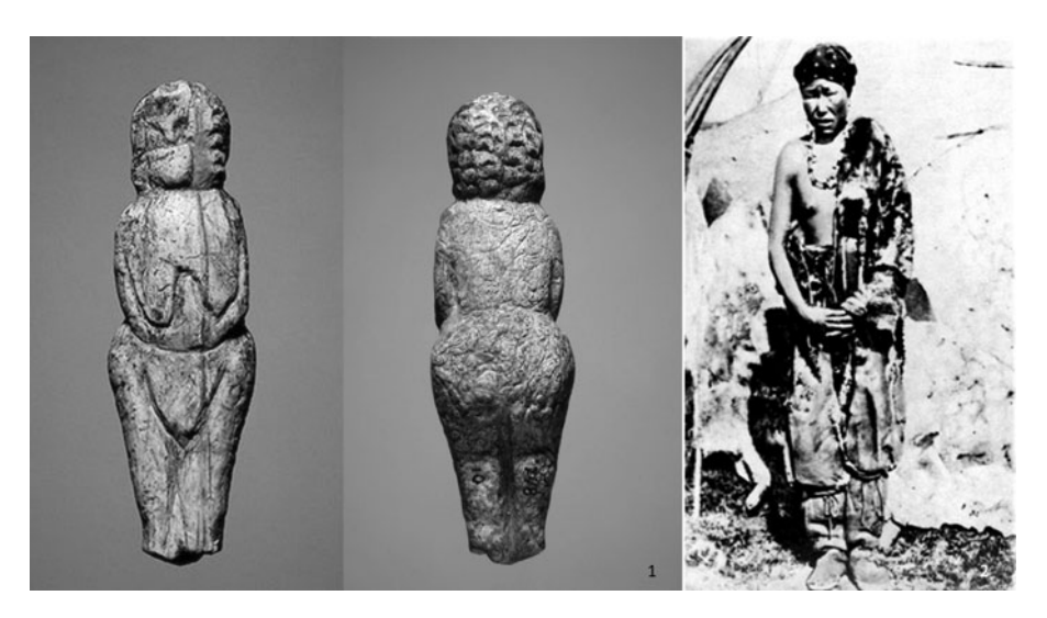
Figure 4. (1) Image of an adult woman from the Mal'ta Collection (Hermitage, No. 370/748); (2) a photograph of northern Indigenous Chukchi woman in summer (Bogoraz, 1904, plate XXVII, fig. 3).

and objects ornamented in part or in full. The figurines which are engraved can be broken into the following groups: