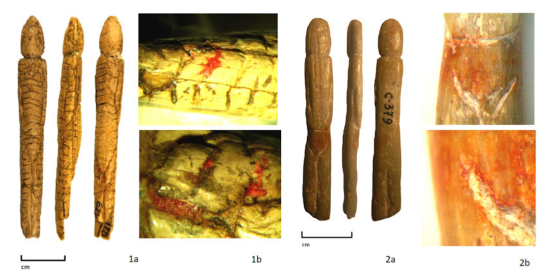
Figure 5. Images of teenage girls: (1a) Mal'ta collection (N 1822/629 State Historical Museum); (2a) Buret collection (C 379, Irkutsk Regional Art Museum); (1b, 2b) macro photos (with magnification of 10×, 20×) of the painting area with ochre.

natural mineral pigments and artificial paints in different spheres of the live Mal'ta inhabitants, include attention to figurines of pubertal age girls.