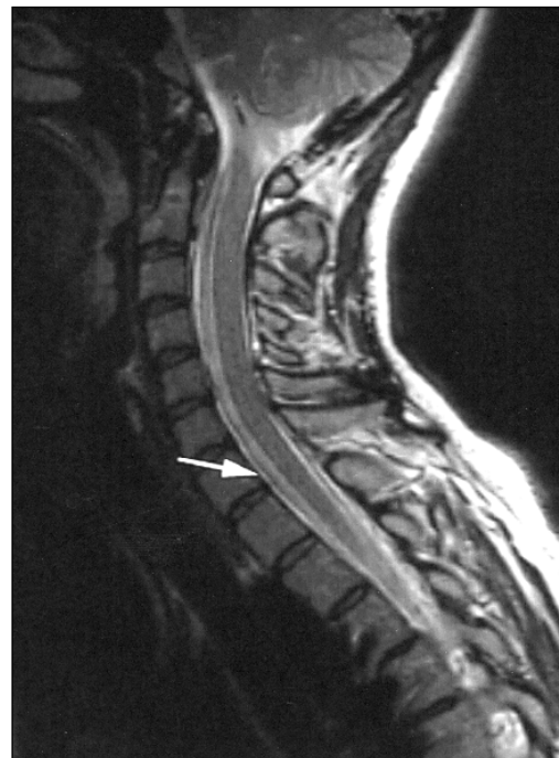
Figure 2: Sagittal T1 weighted MRI of the cervical spine demonstrating subdural fluid collection from C1-T1 (Patient 2)

holocranial headache was relieved in a recumbent position. Neurological exam was normal except for neck tenderness. CSF revealed a 1630 mg/L of protein, normal glucose, 4 WBC/mm 3 and no red blood cells. CSF cultures and cytology were negative. CSF pressure was less than 30 mm H 2 O (normal levels should be 100-200 mm H 2 O), computerized tomography (CT) scanning and cerebral angiography were negative. Magnetic resonance imaging showed diffuse pachymeningeal enhancement, extradural fluid from C1-3 and an enhancing lesion in the head of the right caudate (Figure 3). Due to the caudate lesion, rheumatology and endocrinology screens were done and found to be within normal limits. A bone scan and a gallium scan to rule out lymphoma were negative. Chest/abdomen/ pelvis CT was negative. She was treated with intravenous hydration and bedrest. Repeat MRI several months later when patient was asymptomatic showed complete resolution of both the meningeal enhancement and the caudate lesion.