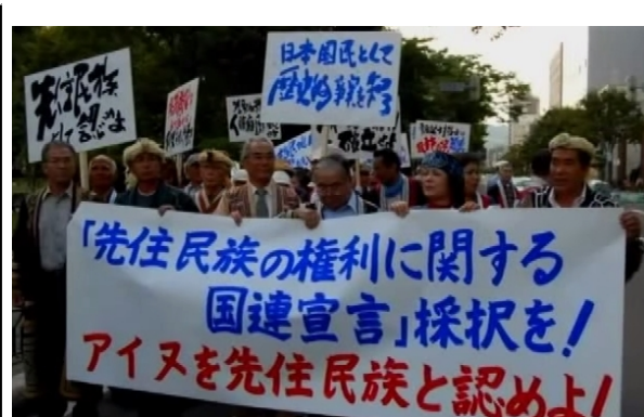
Demonstrators call for official recognition of the Ainu's rights as indigenous peoples.

But in these cases, Ainu policy as construed in terms of the constitution depends not upon clear stipulations found in the actual constitution itself, but rather on the interpretations of a handful of constitutional scholars. Moreover, Article 13 of the constitution clearly deals with the human rights of individuals (not of groups), and does so only to the extent that this "does not interfere with the public welfare". In other words, while the criteria of the United Nations Declaration on the Rights of Indigenous Peoples emphasizes the centrality of collective rights, Ainu policy falls at the exact opposite end of the spectrum: it is presented as a matter of the rights of individuals to "life, liberty, and the pursuit of happiness". Tsunemoto came to refer to this unique rights policy in 2010 as "Japanese-style Indigenous Peoples' Policy" 25 . Not surprisingly, this idea has become an extremely effective back-up for the Japanese government, particularly for central government bureaucrats who are reluctant to support group rights.