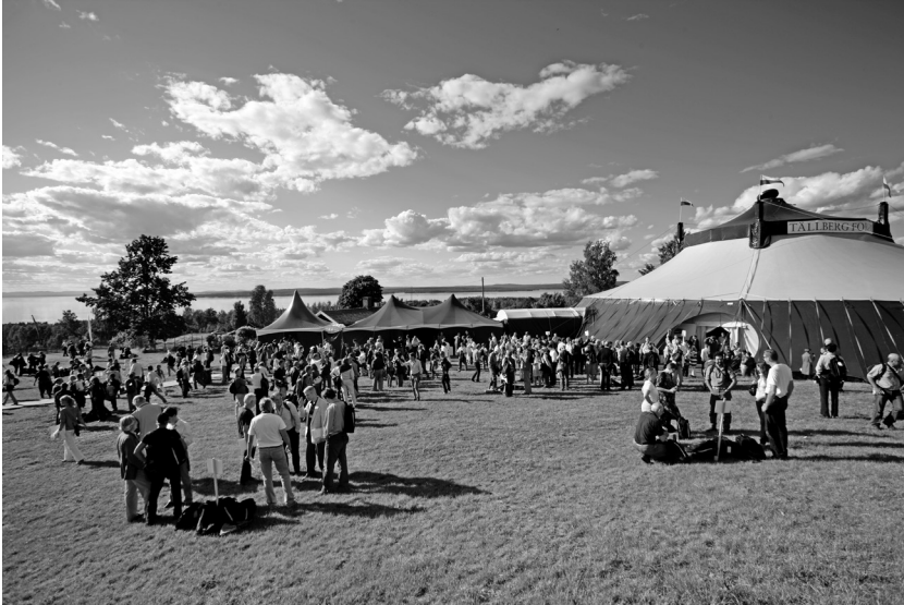
FIGURE 7.3 Tällberg, a small village in the province of Dalecarlia, Sweden, was the place of several years of Midsummer conferences where Earth System scientists and other scholars engaged and networked with politicians, activists, artists, businessmen, trade unions, sponsors, media, royalty, and members of the general public. Workshops took place in nineteenth-century cottages, talks were held, and music was played for hundreds of people in big tents. Collective nature walks took place in the surrounding landscape in an old Swedish out of doors tradition.

exchange under the banner “How on Earth can we live together?.” In a village of small wooden houses, Tällberg Forum sessions took place inside large circus-style tents that could be seen as symbolizing the “big tent” approach to global problems that the Tällberg Foundation had fostered for forty years.