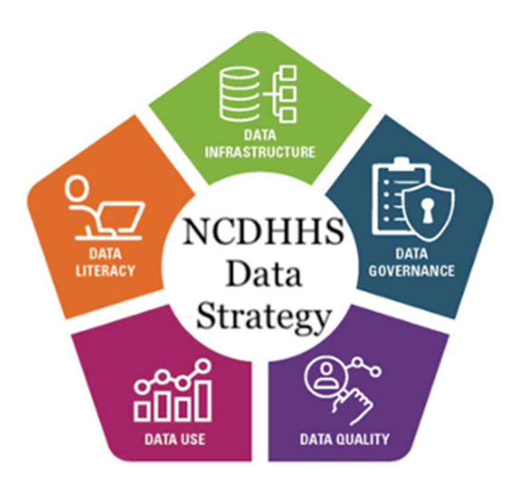
Figure 1. Five pillars of NCDHHS data strategy framework.

engaged to support data governance initiatives and incorporate data governance into the daily operations of the NCDHHS Data Office. AISP functioned as a member of the team working under the CDO. One of the CDO's first tasks was creating the NCDHHS Data Strategy Framework shown in Figure 1. While this research focuses on the work around the data governance pillar, all pillars are interrelated and essential to NCDHHS' data-driven mission.