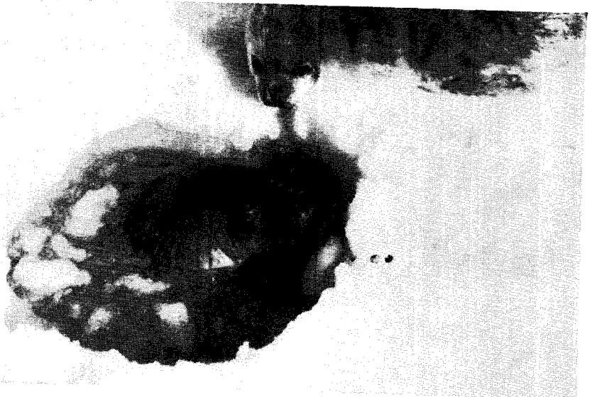
WEDDELL SEAL AND PUP.