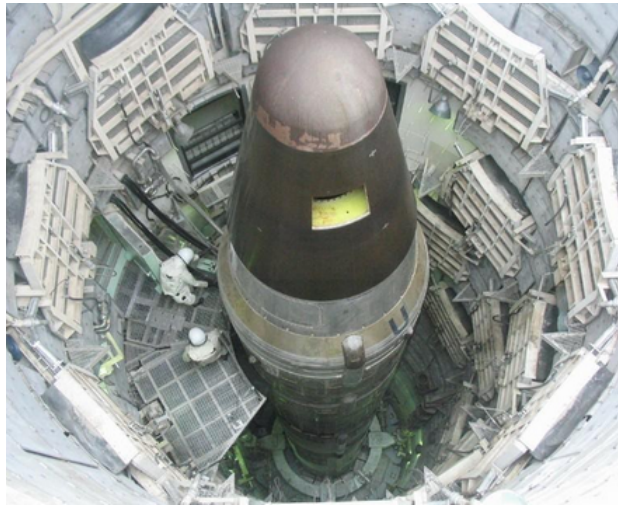
Titan Missile, Tucson Museum

accidents with Titan missiles, and it raised the real possibility of an inadvertent launch. If the target of a nine megaton missile (the size of the Damascus warhead) had been Leningrad, this would have resulted in an estimated 2.4 million fatalities and a further 1.1 million casualties. 25