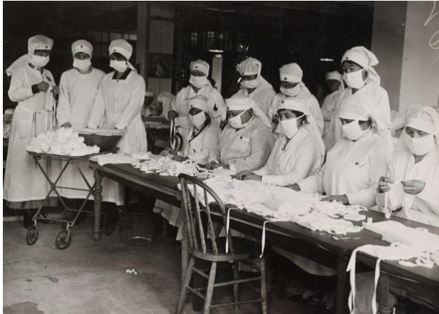
Red Cross Workers in the First World War Making Masks (1918).

Why have we failed to take precautions against a global pandemic until it was upon us? And why have we so often ignored or played down the warning signs of other dangers that threaten us in what now amounts to a perfect storm? Here I shall look at three of these threats – the pandemic itself, the climate crisis, and the lurking danger of a nuclear weapons disaster by accident, or of nuclear war by miscalculation or design. (This is only a selection from the list of “existential risks” identified in current research, such as nanotech weapons, engineered biological agents, and the unforeseen consequences of robotic technology and artificial intelligence).