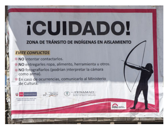
PLATE 1 A sign supplied by the Peruvian Ministry of Culture and posted on a riverfront building in Boca Manu warns residents to avoid conflicts with voluntarily isolated indigenous groups by not attempting contact, not providing goods or supplies, and not photographing them, and to report any encounters to the Ministry. Sightings are becoming increasingly frequent on river banks in the Manu region.

Coca production The cultivation of coca leaves, the source of cocaine, in Peru is second in volume only to Colombia and, although permitted in some quantity for traditional use, is mostly illegal (UNODC, 2015a,b). Cultivation is closely linked to road development in the western Amazon: during the 1960s-1970s, government-sponsored road projects and colonization schemes drew farmers to the region, many of whom later turned to coca as an alternative cash crop in the face of dwindling government support and falling prices for their legal commodities (Dávalos et al., 2016). Although currently in general decline nationwide, coca production in Madre de Dios has increased by > 52% in recent years; Cusco's Kosñipata district (of which Pillcopata is the capital) has also seen production increase, from 338 ha in 2010 to 1,322 ha in 2014. Much of this production is destined for Brazil, the world's second largest market for cocaine (UNODC, 2015b). The most direct route to Brazil from Madre de Dios is either across an expansive, mostly uncontrolled border with Bolivia to the east or directly into the Brazilian state of Acre, to the north; both of these are accessed easily by the newly paved Interoceanic Highway. The improved connection of coca-producing areas in Manu to the Interoceanic Highway via Boca Colorado (Fig. 1) could therefore have a dramatic impact on illicit coca production and cocaine trafficking in the region.