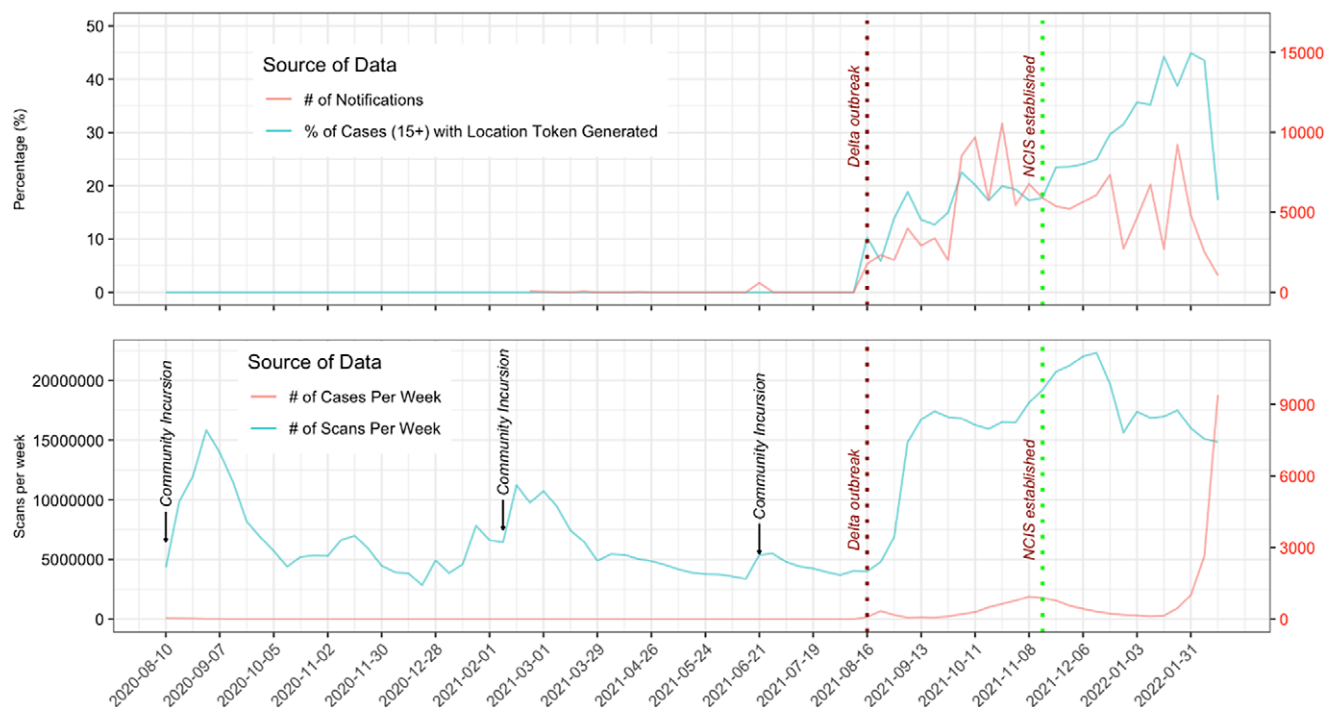
Figure 2. Percentage of cases with location token generated and number of location notifications (top) and number of COVID-19 cases per week and New Zealand COVID Tracer App scans per week (bottom).

*Community incursions: On 11 August 2020, four of the new cases are in the community. It was 102 days since the last case that was acquired locally from an unknown source; on 14 February 2021, Auckland was put into Alert Level 3 lockdown at 11.59 pm after three cases were detected in the community in South Auckland; on 22 June 2021, quarantine-free travel to New South Wales was suspended after 10 new community cases were reported in NSW; and on 23 June 2021, the Wellington Region was put into Alert Level 2 at 6 pm following the visit of an Australian man who tested positive after returning to Sydney.