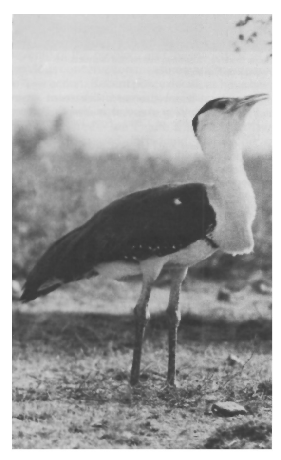
A male great Indian bustard.

In 1981, as a result of Dr Sálim Ali's assessment of the deteriorating status of the great Indian bustard, the Bombay Natural History Society embarked on a five-year project to study the ecology and distribution of the bird. The author, who has worked on the great Indian bustard in three places in India and who took part in the BNHS bustard project, describes its findings.