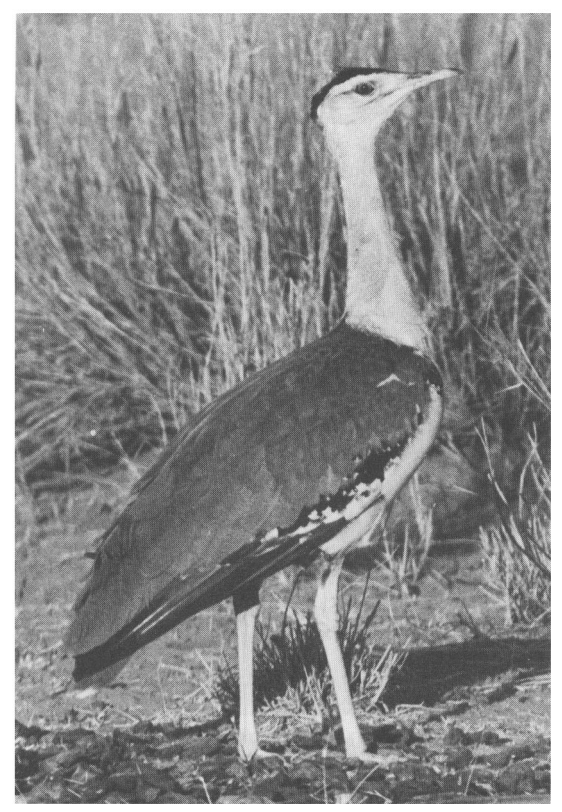
A female great Indian bustard (Asad Rahmani/ Bombay Natural History Society).

1986). As the breeding season approaches, adult males separate to establish territories. It is possible that a male occupies the same territory every year; one colour-banded male occupied the same territory for three consecutive years (the studies are still going on).