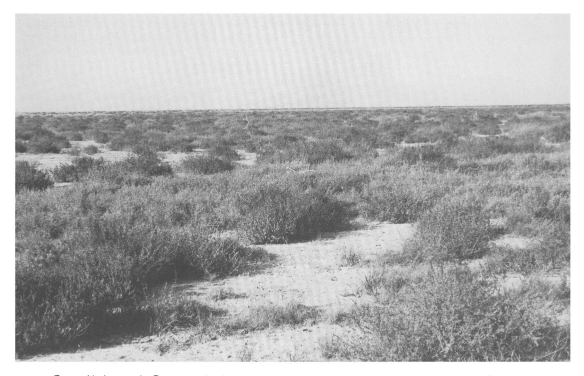
Bustard habitat in the Banni grassland in Kutch, Gujarat.

hatches, it is fed beak-to-beak for two to three months. Occasional beak-to-beak feeding is seen even when the juvenile is almost the size of the mother. The breeding season varies over the bird's range, but everywhere coincides with the period when insect populations are high. The fledgling period lasts five to six weeks, but the chick follows its mother for a year until the next breeding season.