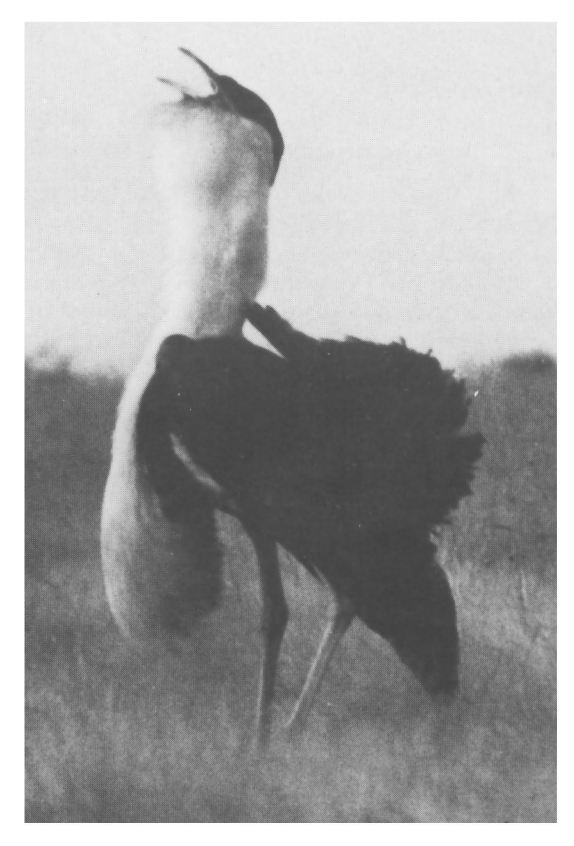
A male great Indian bustard calling while in courtship display (Asad Rahmani/Bombay Natural History Society).

Incubation and rearing of the chick are undertaken solely by the female. As only one egg is laid, it is not easy to discover the date of laying because it is unlikely that the egg is found on the day it is laid. However, on three occasions, we have noted hens incubating for 27 days. The chick is fed mainly with animal matter, such as insects and small lizards. Although the chick can feed itself and can leave the nest soon after it