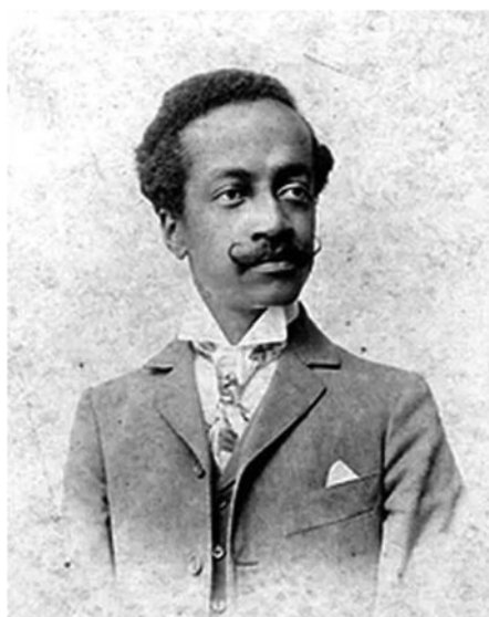
Fig. 1 Juliano Moreira [1872–1933].

© The Author(s), 2024. Published by Cambridge University Press on behalf of Royal College of Psychiatrists.