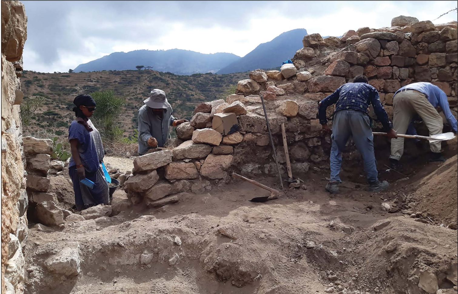
Frontispiece 2. Excavation of a mosque at Harlaa, Ethiopia, 2024. Harlaa was a major Islamic trading town in eastern Ethiopia (see Antiquity 95: 487–507). Earlier work undertaken by the 'Becoming Muslim' Project, directed by Timothy Insoll with European Research Council funding (2016–2022), culminated in a new community museum. The latest investigations, facilitated by a generous philanthropic donation, include excavation of a mid-twelfth- to mid-thirteenth-century mosque. The building will be conserved and will form part of a community-based heritage trail to generate tourist income. In addition to the local community in Ganda Biyo (Harlaa), the project partners are the Dire Dawa Culture and Tourism Office and the Ethiopian Heritage Agency, with the participation of Ethiopian PhD students Temesgen Leta and Endris Hussein of the University of Exeter.