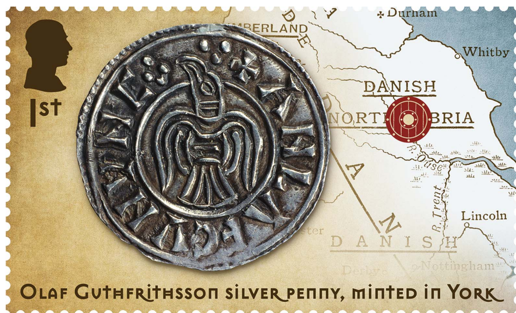
Figure 2. First-class stamp featuring a silver penny of Olaf Guthfrithsson minted in York, one of eight new stamps issued in February 2024 to mark the Viking legacy in Britain.

were made from recycled Byzantine silver plate; then, from the mid-eighth century, there was a rapid and widespread shift to the use of silver that was newly extracted from mines at Melle in Aquitaine (pollution from which has been detected in Alpine ice). 20 This centralised supply of silver, combined with the standardisation of coin size and weight, emphasises the political and economic control of the Carolingian state in extending its sphere of influence across north-west Europe—was the penny mightier than the sword?