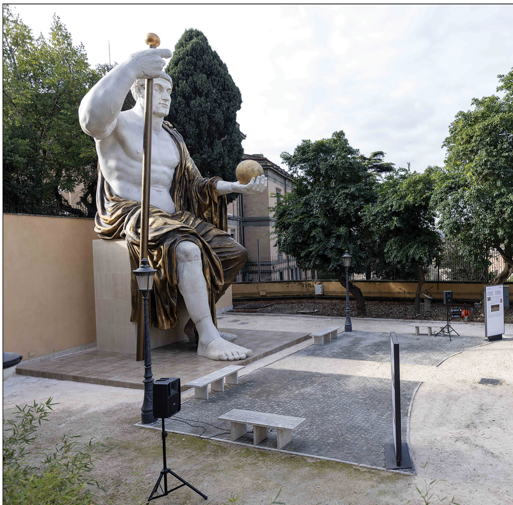
Figure 1. Reconstructed colossal statue of Constantine in the garden of the Villa Caffarelli on the Capitoline hill, Rome.

Given current debate around the statues of historical figures, we might wonder: why a statue of Constantine? Why not, for example, a statue of Elagabalus? Presumably the latter's character is too tarnished by the writings of contemporaneous and later historians; unlike Richard III, there is no society dedicated to rehabilitating Elagabalus' reputation. Or perhaps the precise subject is secondary and the explanation lies in the enticing nature of the archaeological fragments—displayed for centuries like the remains of an autopsy of power—and a compulsion to reconstitute the whole. Surely there is some deeper significance to the enterprise than simply that the technology exists or because a corporate sponsor thought it would be good publicity?