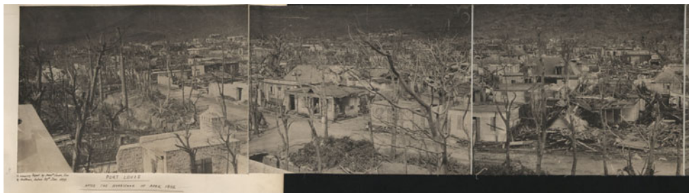
Figure 2. ‘Port Louis after the hurricane of 1892’. Reproduced with permission from CO 1069/746, The National Archives, Kew

part of the meteorologists of the island to telegram on the evening of the 28th ... [that] there was nothing to be apprehended’. 65