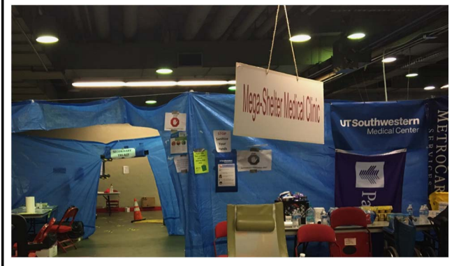
MegaShelter Medical Clinic Entrance.

to align with partnering agencies. Daily incident command briefings and metrics reporting provided timely situational awareness and identification of unmet needs and resource utilization. Just-in-time protocols and clinical pathways supported seamless integration among a variety of multi-disciplinary health professionals.