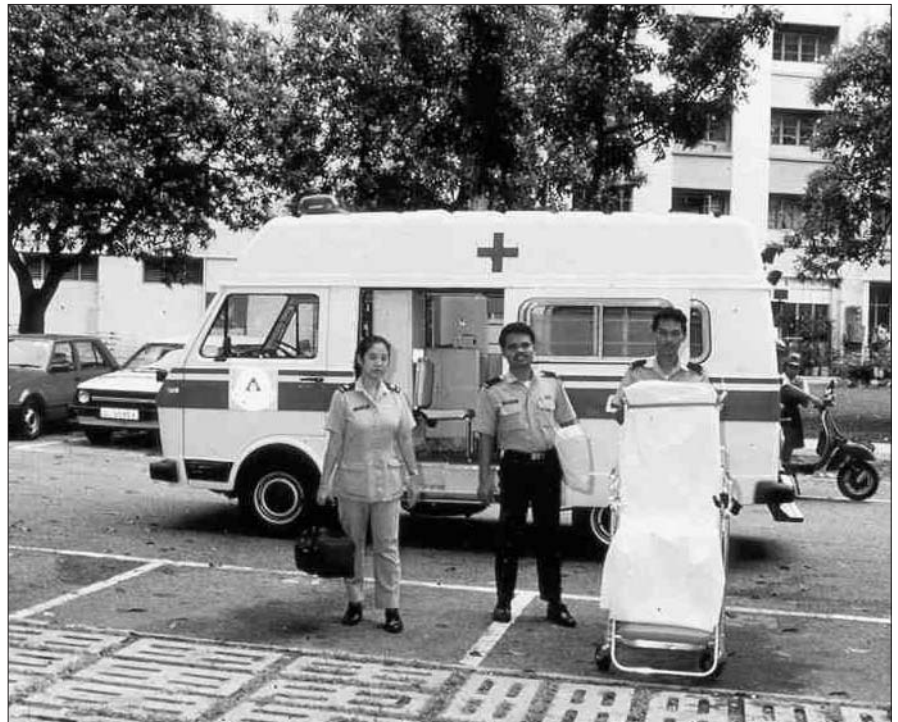
Three crew members of the Emergency Ambulance Service

Prior to 1997, the EAS functioned without a formal program of medical oversight and review. In 1997, the Medical Advisory Council was established, consisting of 3 emergency physicians, 2 surgeons, a cardiologist, an anesthetist and a pediatrician. The Medical Advisory Council, chaired by an emergency physician, governs, endorses protocols and procedures, and assures quality and standards