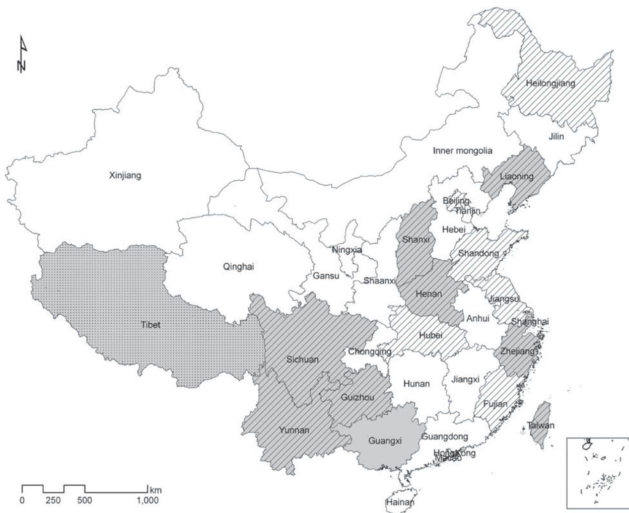
Fig. 2. Map of China showing provinces where JEV strains were circulating.

and Hubei. In Guangxi province, only genotype I was confirmed as circulating. Genotypes I and V co-circulated in Tibet. Table 1 shows the numbers of isolates in genotypes I and III in each endemic province.