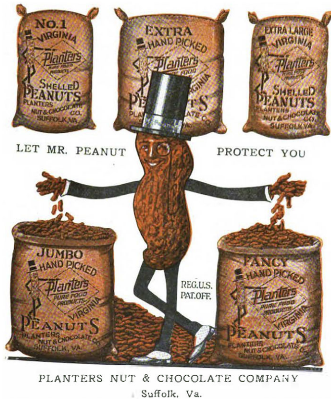
Figure 1. Mr. Peanut, on the cover of an industry periodical, advertising Planters as a regional peanut buyer. Source: The Peanut Promoter 7, no. 3 (1922).