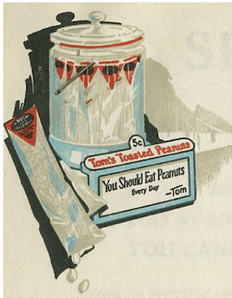
Figure 3. Letterhead depicting Tom's countertop marketing material.

was that Huston pushed peanuts all over the United States in "tall, slender bags with a red seal at the top." 91