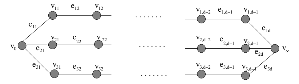
Figure 3 : The dual graph \mathcal{G} of the special fiber of \mathfrak{X}_0(\mathfrak{q}) over Spec( \mathfrak{O}_{\mathcal{L}} ).

Two vertices are joined by an edge if they intersect. The set \mathcal{E}(\mathcal{G}) of (ordered) edges of \mathcal{G} is therefore in bijection with the singular points of the special fiber, and we write