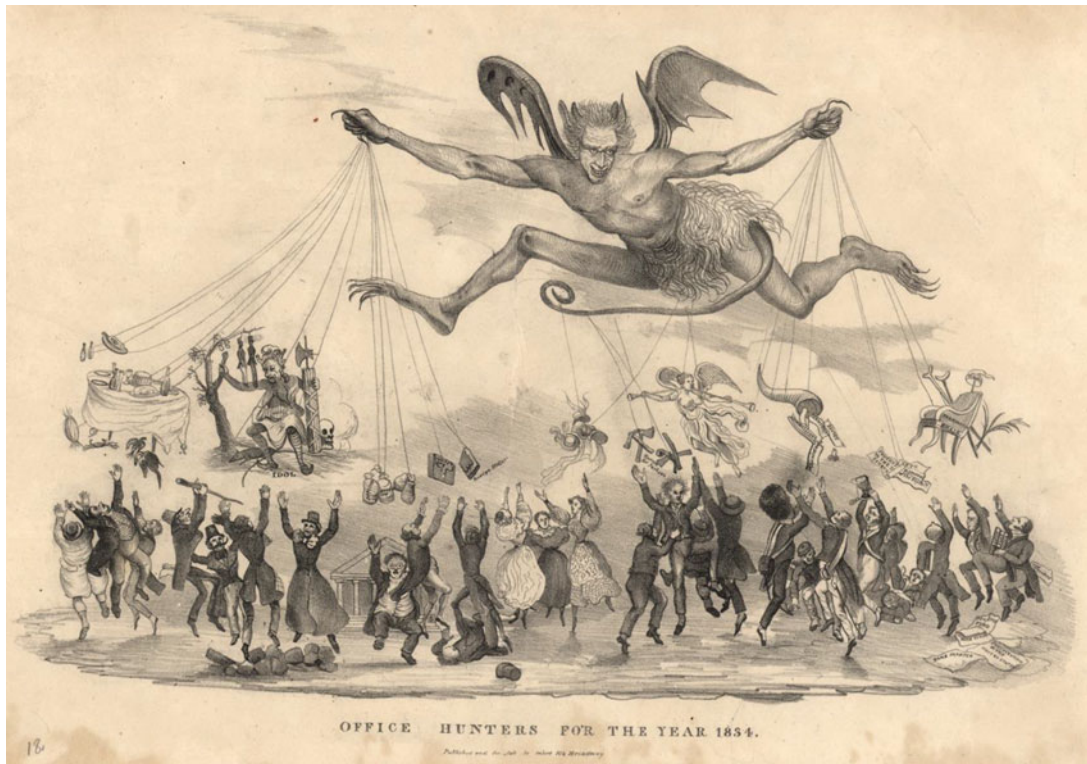
Figure 4. Office Hunters for the Year 1834.

Sir Emil Hurja Collection, Tennessee Historical Society, Tennessee State Library & Archives, Nashville.