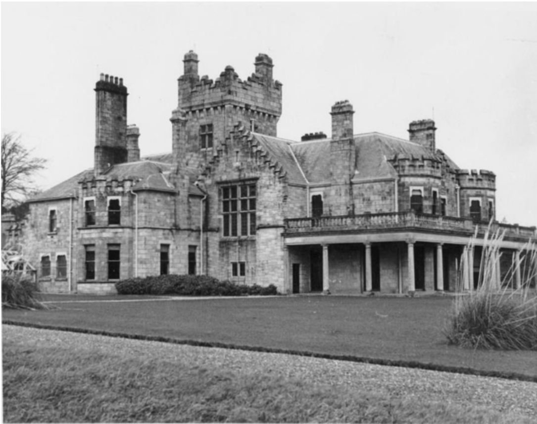
Figure 2. Glencairn Castle.

and local level. 10 The “associational state” foregrounded the role of civic forces in mobilizing private networks for an expansive array of public purposes, although less has been noted about voluntarism’s patrimonial imprint. 11 Richard Bense’s “Yankee Leviathan” concept advanced the Civil War as a critical juncture in the creation of an empowered fiscal-military state. 12 Each of these approaches capture key dynamics of the republic’s classical age before major restructuring during the twentieth century. 13