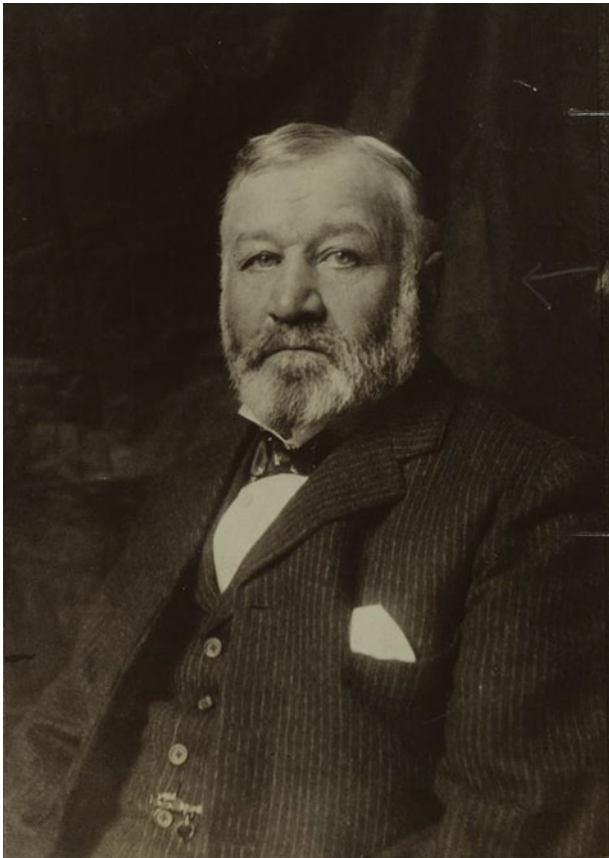
Figure 1. Richard Croker of Tammany Hall.

When Boss Croker mounted a public defense of Tammany Hall, he did so on very different grounds than invocation of commercial self-interest. Writing in the North American Review , a fashionable literary magazine, Croker explained that his organization worked to preserve the values of hierarchy, order, and loyalty within a “system of deferential compromise.” 6 How could Tammany be so vilified in the court of respectable opinion, Croker supposed, when clientelism was a cherished tradition deeply embedded within the country’s own representative institutions? The magazine’s Gilded Age society audience might have hemmed and hawed, as Protestant U.S.-born middle-class readers wary of Tammany’s working-class, Catholic and immigrant electorate. But many contemporaries, beginning with elite reformers, conceded Croker’s basic point about historical legacy.