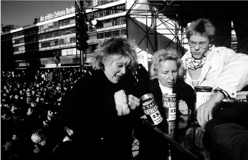
Figure 3.8 Danish singer Gitte Haenning (left) with German actress Edith Hancke at the recording of the Ein Tag für Afrika television fundraiser, 23 Jan. 1985.