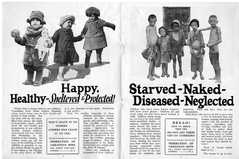
Figure 3.5 Screenshot of the pamphlet Jewish Life Here and There – Some Pictures and a Few Facts by the Federation of Ukrainian Jews, London, 1922.

American Relief Administration Russian operational records, Box 92, Folder 3, Hoover Institution Archives