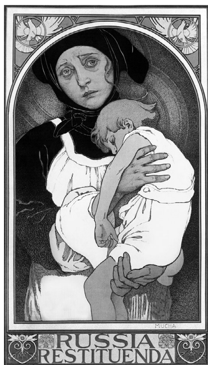
Figure 3.4 Russia Restituenda (Russia Must Recover), 1922.

Poster by Czech artist Alfons Maria Mucha. Used as a plea to help starving Russian children.