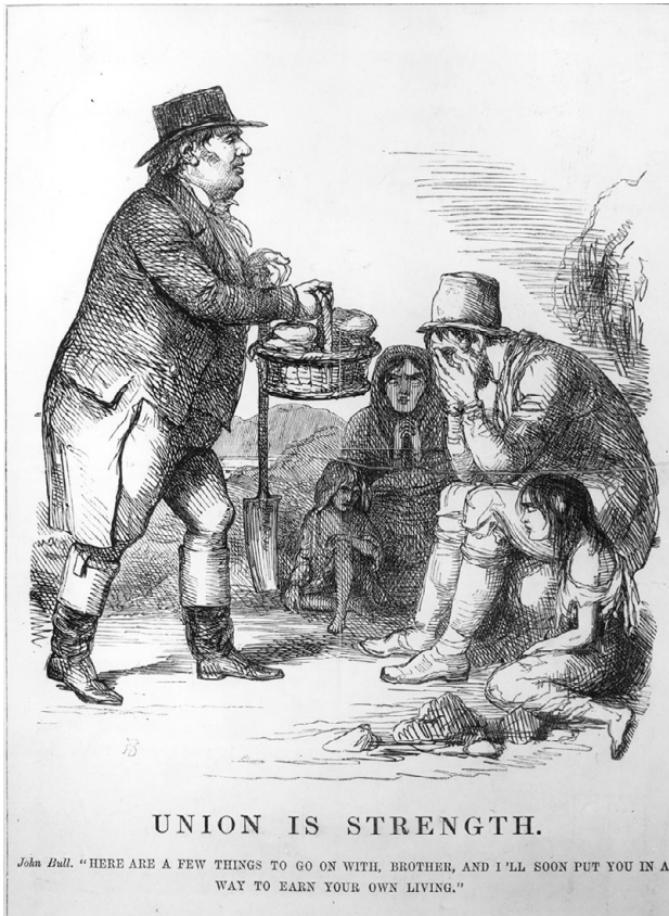
Figure 3.2 English benevolence for Ireland, Punch, 17 Oct. 1846. Drawing by Richard Doyle.

organised in the English church in Hamburg did not attract many people and received a very poor review. 61 Meanwhile, at a public concert in London, Jenny Lind's fee for an opera season was said to be £12,000 plus travel and lodging, something that made another German newspaper exclaim with moral economic indignation, 'And all this, while Ireland starves!' 62