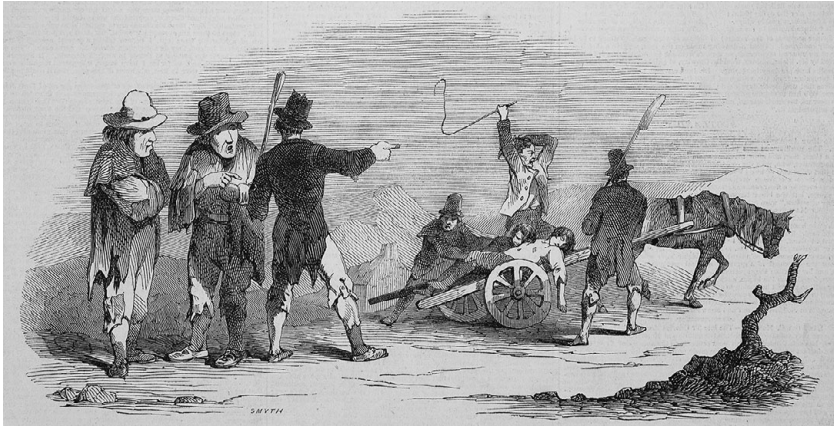
Figure 3.1 Funeral at Skibbereen, London Illustrated News , 30 Jan. 1847. Engraving from a sketch by H. Smyth.

tomb. Wellington was to invoke the queen's female sense of decency, and let the published letter's account of destitution and nakedness encourage her to command that aid no longer be withheld. 34 The letter illustrates that the gendered perception of emergencies and the addressees of calls for aid has not changed over time. Other direct appeals to the queen petitioned her 'as a woman' and 'a mother'. 35 They all mirrored the widespread notion in Ireland of being entitled to aid from Britain, and minor sums were immediately sent to the Cork magistrate for distribution. 36 However, according to one Irish calculation, their country was entitled to thirty million pounds, a sum greater than that spent for ending slavery, as Irish distress was said to exceed that of the blacks. 37