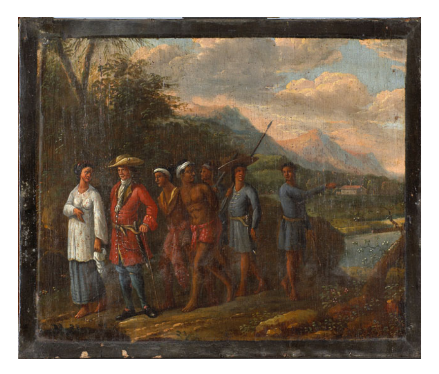
IMAGE 2. Merchant of the Dutch East India Company with his wife, soldiers, and enslaved or captive individuals.

and Makassar in the seventeenth century<sup>37</sup> and, in the late eighteenth century, the Sulu Sultanate.<sup>38</sup>