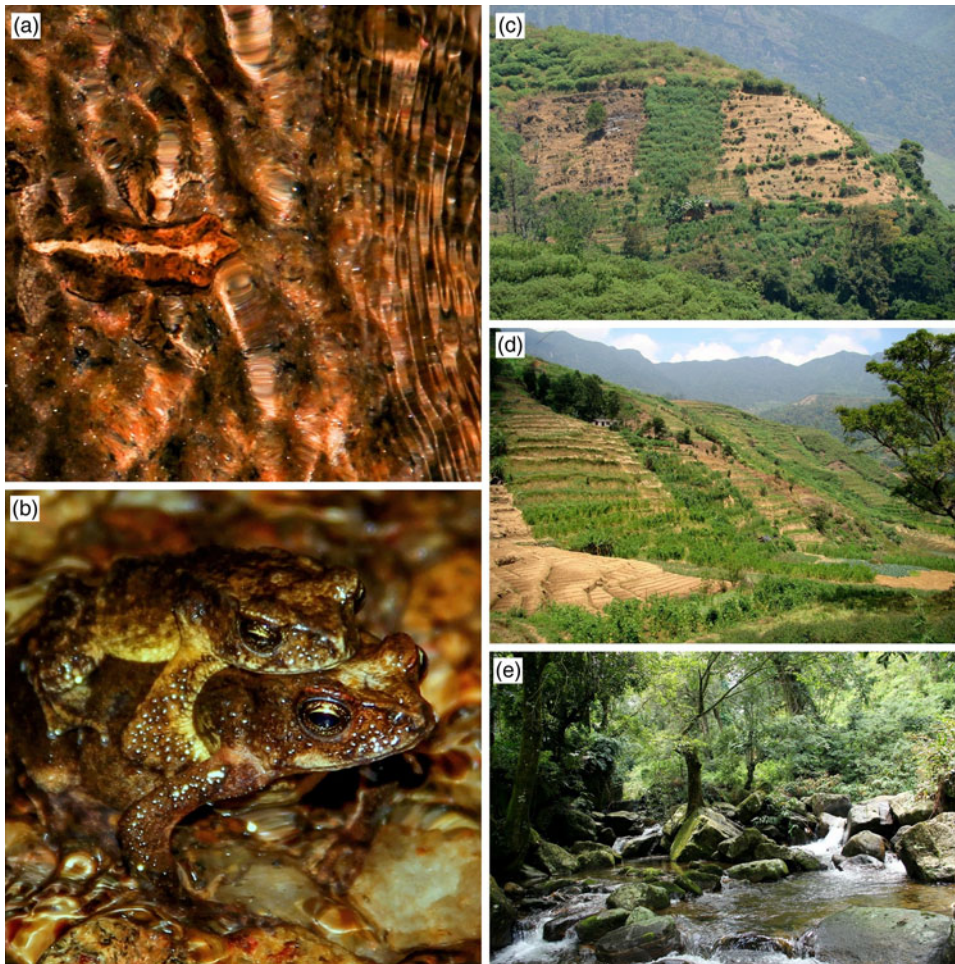
PLATE 1 (a) Adenomus kandianus underwater, camouflaged against the rocky streambed, (b) male (on top) and female Adenomus kandianus in amplexus, (c) and (d) plantation agriculture and deforestation around Pidurutalagala Conservation Forest, and (e) the stream segment at Pidurutalagala Conservation Forest, one of two known localities of Adenomus kandianus .

regression model (a mixed-model approach) in which all the environmental variables were considered to be predictor variables and the abundance of toads was the response variable. Statistical analyses were conducted using various packages (ANCOVA: aov ; linear regression: lm ; and \chi^2 test: chisq.test ) in R v. 2.15.0 (R Development Core Team, 2011).