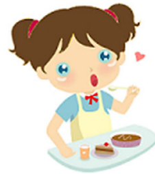
Figure 1. Images displayed for one of the sentences in the Iconic/Natural/Before condition, “The girl blew out the candles before she ate the cake.” The image on the left reflects the correct response to “What happened first?” and the right-hand image is the foil.