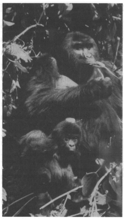
Female Graeuer's gorilla with baby from mountain sector of Kahuzi-Biega National Park (Kristin Saltonstall).