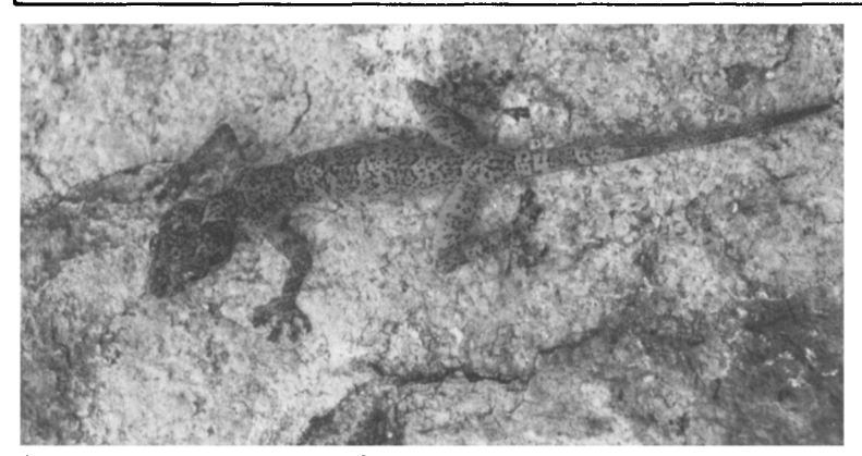
Golden gecko, rediscovered in 1985.

of rhino horn are switching to the hom of the Saiga antelope Saiga tatarica, which is not in danger.