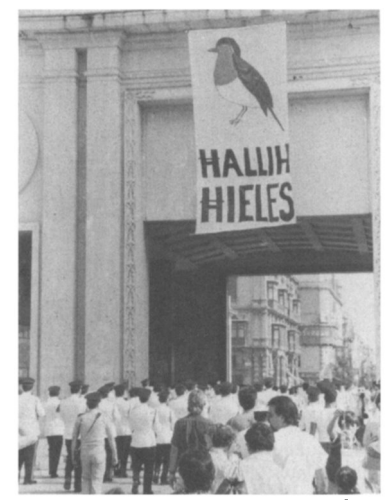
The banner hung above Valetta City Gate at the launch of the anti-robin trapping campaign in Malta. The slogan. translated, reads 'Let it free'.

stuck lapel stickers on passers by. A further 60.000 stickers and 10.000 leaflets were distributed in schools. The Ornithological Society of Malta.