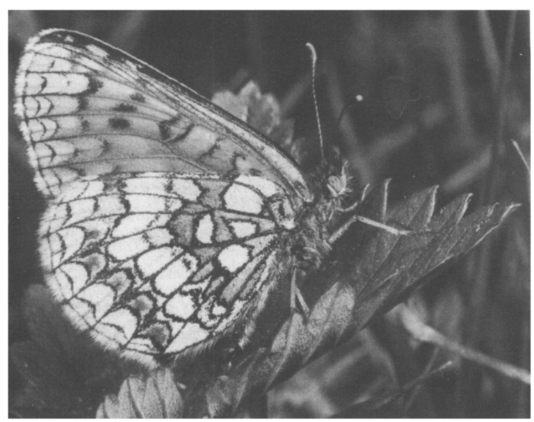
The heath fritillary—a conservation success story (by kind permission of the Nature Conservancy Council).

crayfish farms, of which there are now 250. A. pallipes is listed as rare in the IUCN Invertebrate Red Data Book, and in Ireland, the only other country where it is still common, imports of foreign craufish are banned.