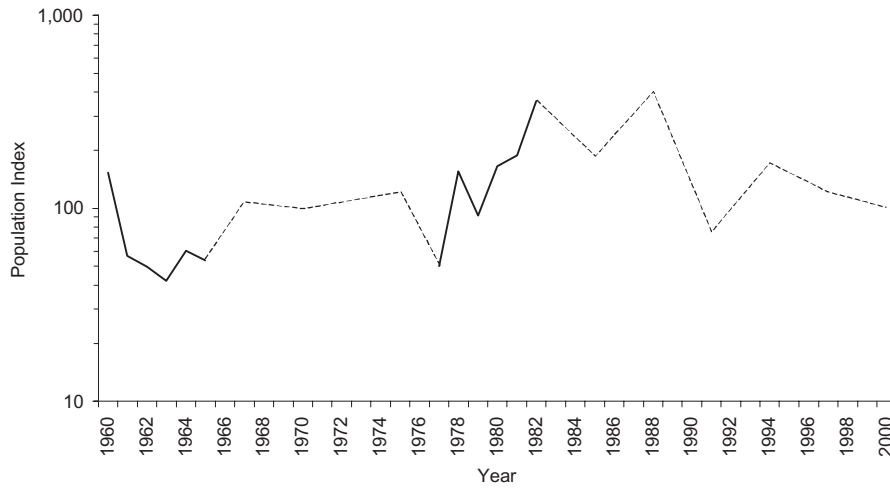
Figure 1. Overall Mexican Duck population indices (log-scale), 1960 to 2000, using mid-winter survey data (see Methods). Solid lines connect surveys in consecutive years, dashed lines connect non-consecutive surveys.