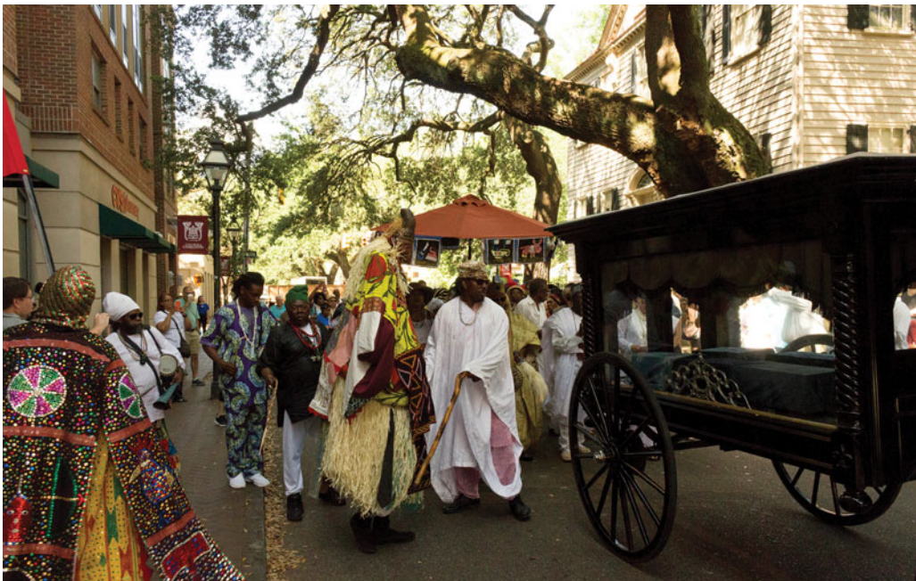
Figure 8. King Adejuyigbe Adefunmi II and the Oyotunji African Village members followed the horse-drawn hearse and led the procession to the reinterment site.

At the reinterment site, the six Ancestors wrapped in indigo were placed in a specially designed vault with the other 30 individuals, along with handwritten messages to the Ancestors composed by community members (Figure 9). Writing messages provided another opportunity for community members to connect with their Ancestors, because this act is an important part of African and Gullah Geechee traditions (Creel 1988). The enclosure of the Ancestors in the vault was followed