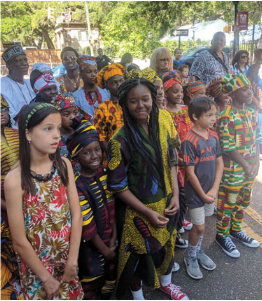
Figure 7. Children of the Watoto Academy of Meeting Street Schools followed the Oyotunji community to the reinterment site.

within 20 miles of Charlestown), which banned enslaved and free African people from gathering and playing African drums (Wood 1996).