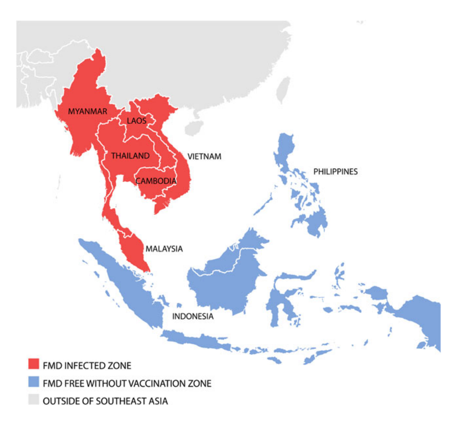
Fig. 1. Map of SEA indicating FMD disease status.

these lineages arose from a common ancestor approximately 35 years ago [4]. Viruses belonging to the O/SEA/Mya-98 lineage have been detected in all six countries of continental SEA over the past 15 years, while the O/SEA/Cam-94 lineage was only identified between 1989 and 2003 and may be considered extinct [4].