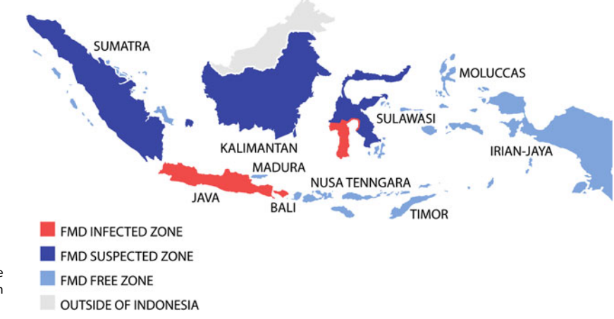
Fig. 2. Map demonstrating the progressive vaccination zones use during the Indonesian FMD eradication campaign. Adapted from Soehadji et al. [60].

possible disease carriers. Vaccination coverage was estimated to involve at least 80% of the livestock population. Vaccinated animals were identified by ear markings and there was a strict control of livestock vehicles to minimise animal movement into the vaccination area. Intensive epidemiological surveillance was performed continuously during the programme to monitor the possible reappearance of cases, and after 3 years, many regions were declared free of FMD.