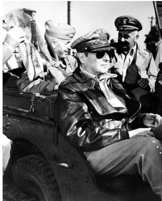
MacArthur at Inchon planning the US counterattack

General Douglas MacArthur thought the conditions were ripe in December 1950 and requested permission to drop a total of thirty-four bombs on a variety of targets. "I would have dropped 30 or so atomic bombs . . . strung across the neck of Manchuria," he told an interviewer, and "spread behind us—from the Sea of Japan to the Yellow Sea—a belt of radioactive cobalt . . . it has an active life of between 60 and 120 years. For at least 60 years, there could have been no land invasion of Korea from the North." MacArthur's replacement, General Matthew Ridgway, requested thirty-eight atomic bombs. In the event, nuclear weapons were not used; the destruction of northern and central Korea had been accomplished with conventional weapons alone.