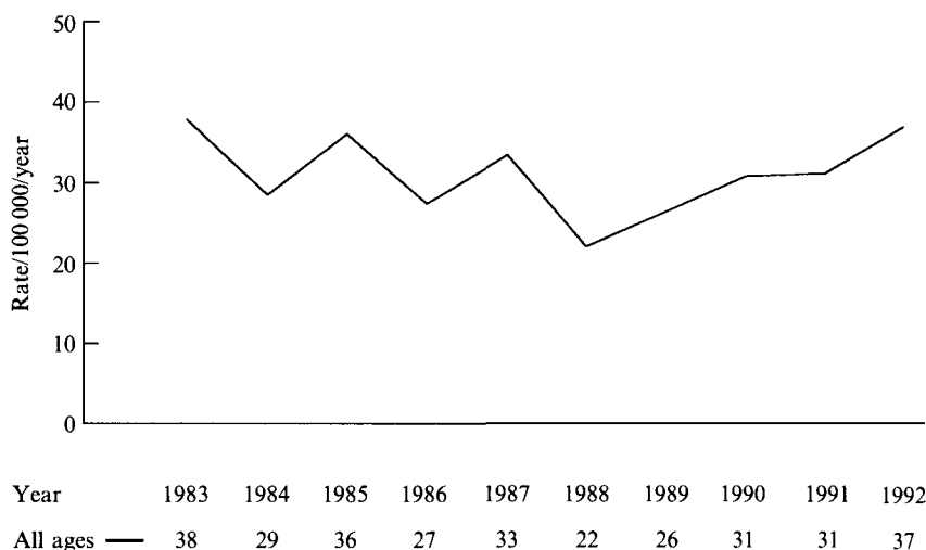
Fig. 1. Notification rates of tuberculosis in Lambeth residents from 1983–92.

Information on notified cases was taken from a local ledger which recorded each notification of tuberculosis in Lambeth residents made to the Office of Population Censuses and Surveys (OPCS). This information gave the patient's name, age, sex, site of disease and address which was put on a computer database (SmartWareII: V1.51). Duplicates were excluded from the database by the use of a computer program. Further duplicates were excluded manually: this was necessary because names from ethnic minorities are prone to transcription errors.