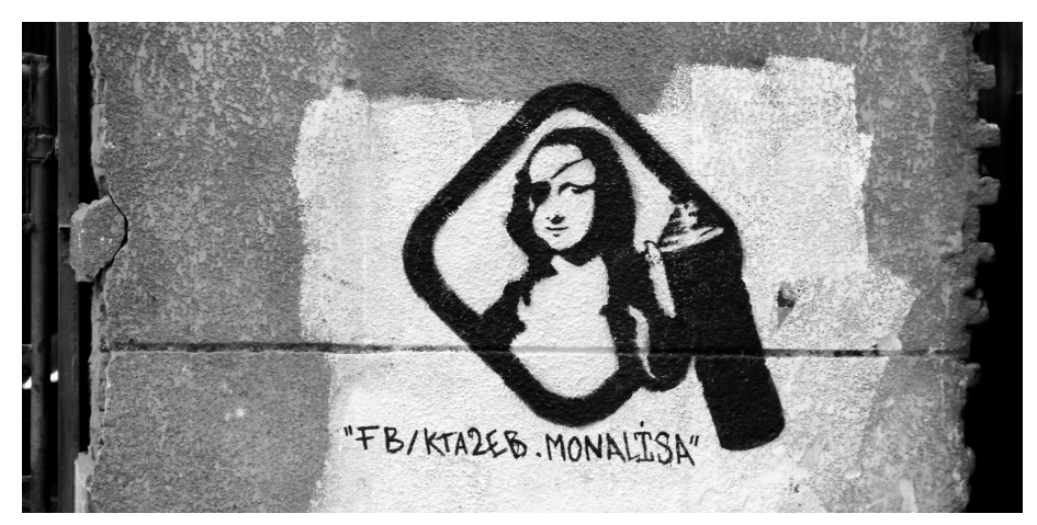
Figure 1. Mona Lisa Battalions logo in Cairo's Downtown area.

This initial phase took about ten weeks. It included many logo designs and discussions on the identity and concept of the group. Some artists in the group decided to start painting scattered murals in the district of Zamalek in Cairo. However, no plans, designs or projects were clear yet.