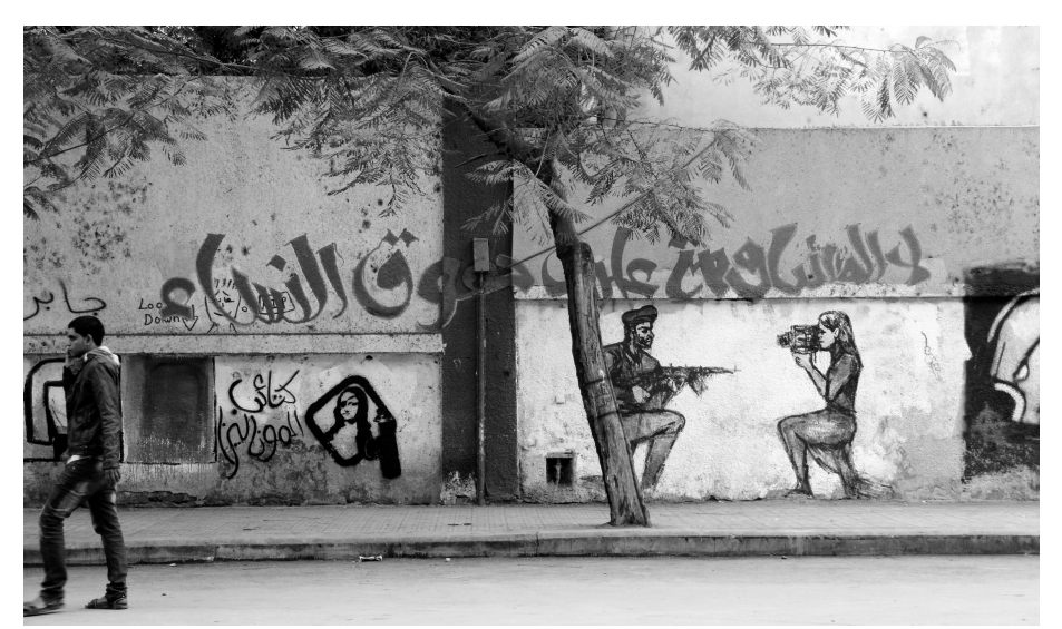
Figure 7. "No Compromises on Women's rights" above Mona Lisa Battalions logo in Mohamed Mahmoud Street in Cairo's downtown area.

growth of El Katā <sup>°</sup> ib introduces new problems. For example, the funding and financial resources that El Katā <sup>°</sup> ib receives require a bank account in the name of an institution. Several discussions have been held on how to institutionalize and legalize the status of El Katā <sup>°</sup> ib . According to the Egyptian law they can become a non-profit company, but in this case they have to pay monthly taxes. Alternatively they can become an NGO, but this will put them under the scrutiny and the control of the Ministry of Social Solidarity. In either case, they are trying to manage the different trade-offs between practical needs and values of independence, flexibility and openness.