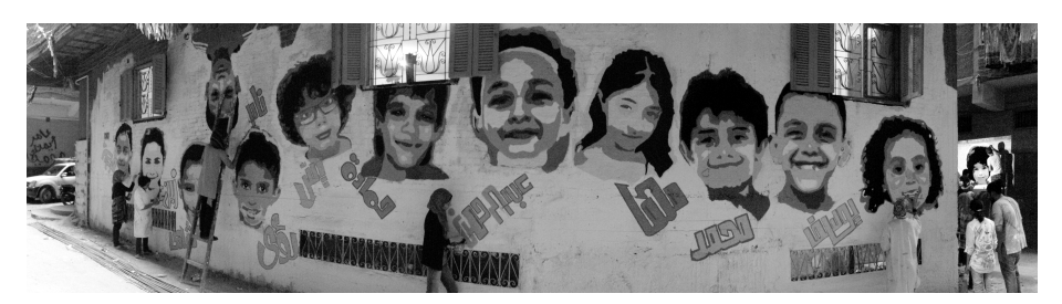
Figure 2. Mona Lisa Battalions artists draw children's faces and names in Ard El-Liwa, during one of the activities of the Nas Ard El-Lewa project.

The first phase of the project was " ayez aba 'a" (I want to be). It started in August 2012 and lasted for three months. The project included interviews with neighborhood children in Ard El Lewa about their dreams and what do they think about their future. Artists then would draw children's faces, names and desires as murals on the walls of their buildings.