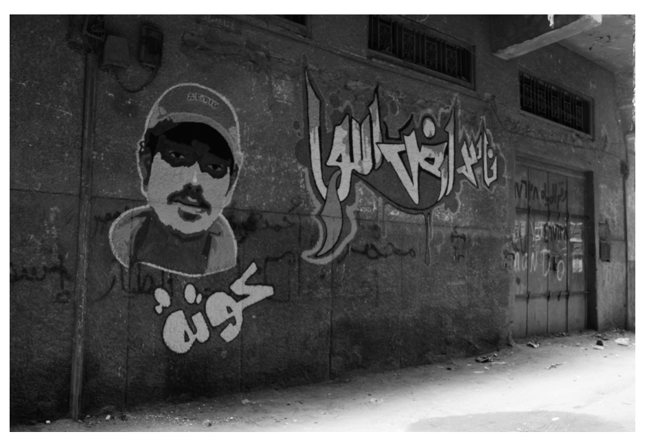
Figure 3. "Nas Ard El Lewa" painted on the wall before the entrance to the graffiti-streets of the Mona Lisa Battalions.