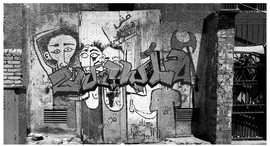
Figure 6. "Free Zwawla" painted by Mona Lisa Battalions artists in Zamalek, over their earlier mural "You won't be able to burn me" (2012).

art of the streets to the exclusive space of the gallery. Language and performances of the street aren't marginalized anymore. What is in the street invades even the exclusive space of the gallery.