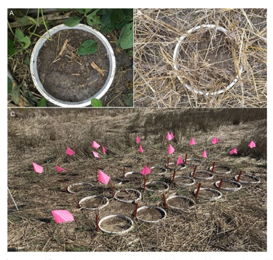
Figure 2. General scheme of experiment in different seed accessions. Experimental unit established in soybean (A). Experimental unit established in wheat stubble (B). Experiment established in wheat stubble (C). Photographs taken from the experiment established in wheat stubble and soybean, North Platte, NE, in fall 2016.