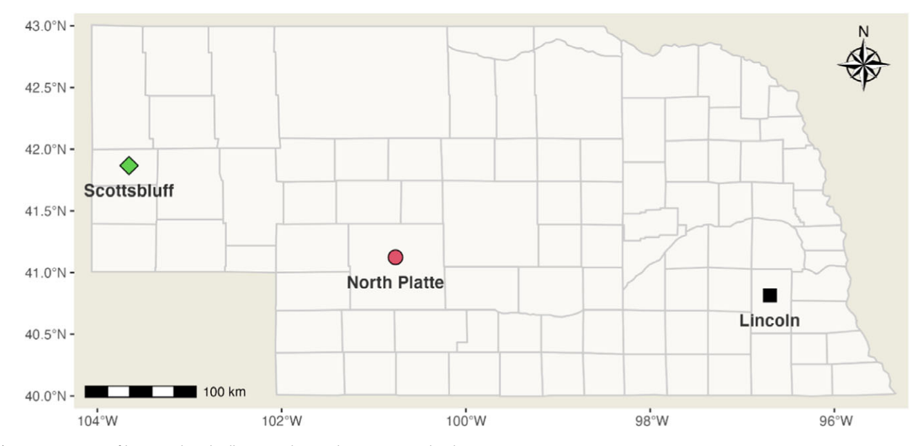
Figure 1. Locations of horseweed seed collection and research sites across Nebraska.

burndown herbicide applications likely selected for spring-emerging horseweed biotypes in Indiana and Illinois (Davis et al. 2010). Schramski et al. (2021) reported that shifts from fall to springemerging biotypes expedited glyphosate resistance evolution. Moreover, horseweed is self-pollinated and a prolific seed producer, producing up to 1 million seeds per plant, with effective wind seed dispersal infesting areas up to 550 km away from the source (Bhowmik and Bekech 1993; Shields et al. 2006; Tozzi and Van Acker 2014). Therefore horseweed seeds can be easily transferred to neighboring cropping systems, and newly introduced horseweed biotopes with genetic diversity and differential response to management strategies make predicting its emergence pattern and control more difficult. Horseweed exhibits different fall- and spring-emerging phenotypes. The fall-emerging seedlings overwinter as rosettes, and a flowering stem starts to elongate in the spring. In contrast, spring-emerging cohorts grow in the upright form, skipping the overwintering rosette stage (Main et al. 2006; Schramski et al. 2021). The differential horseweed growth due to its emergence pattern could increase management complexity, thus warranting studies evaluating horseweed emergence across a range of environmental conditions throughout Nebraska.