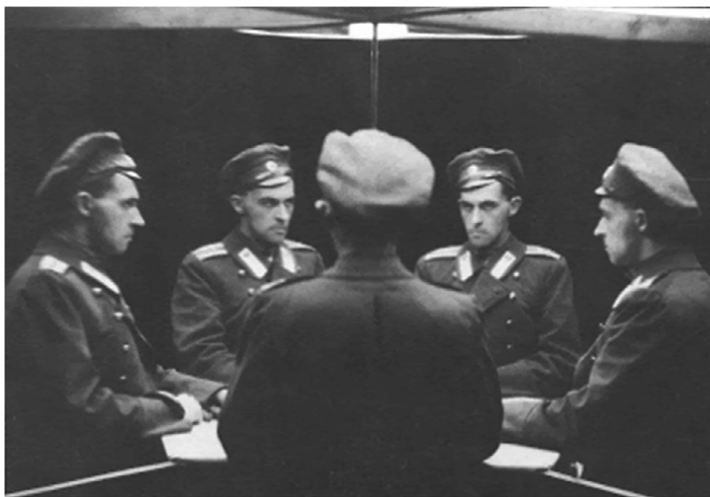
Figure 3. Witkiewicz, photographic portrait, 1916.

Szymanowski's in his programmatic works of the preceding years, in particular in 'portraits' of frolicking and erotic feminine figures of mythic metamorphosis. 81 After a limpid codetta theme to the exposition (b. 60ff) a more developmental section proceeds in which the second subject emerges to displace the attempts to recapitulate the first subject. There is no recapitulation of the first subject. As in the exposition, developmental transformations of the second subject assume the role of climactic intensification, building to the biggest climax of the movement (the Höhepunkt previously noted).