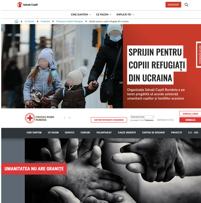
Figure 2. Visuals used to represent Ukrainian refugees on NGOs' crowdsourcing platforms; top , Save the Children Romania; bottom , Romanian Red Cross.

We have discerned two mechanisms employed by actors to establish themselves as owners of the crowdsourcing initiatives: managing visibility and educating