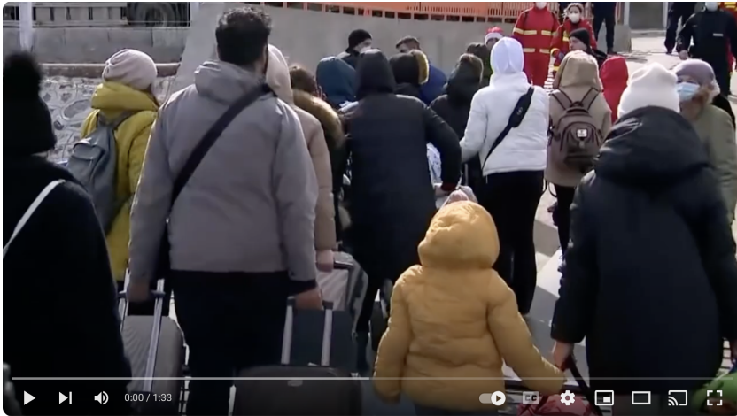
We Are ONE | Manifest for the Ukrainian People