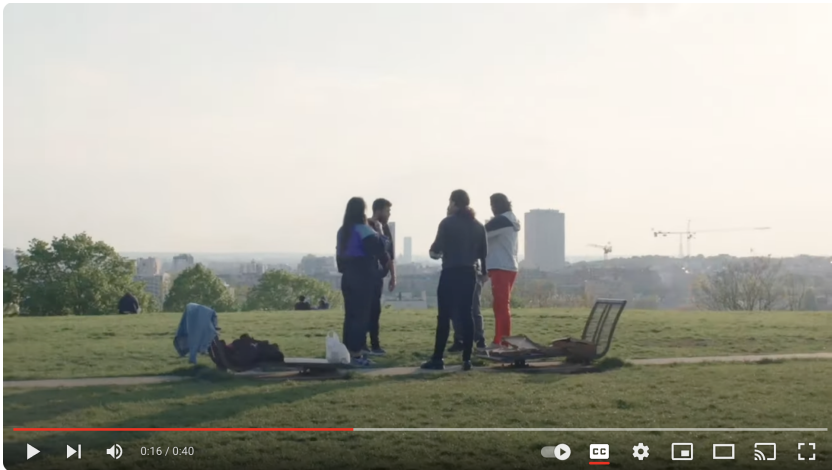
World Refugee Day 2022 – IKEA