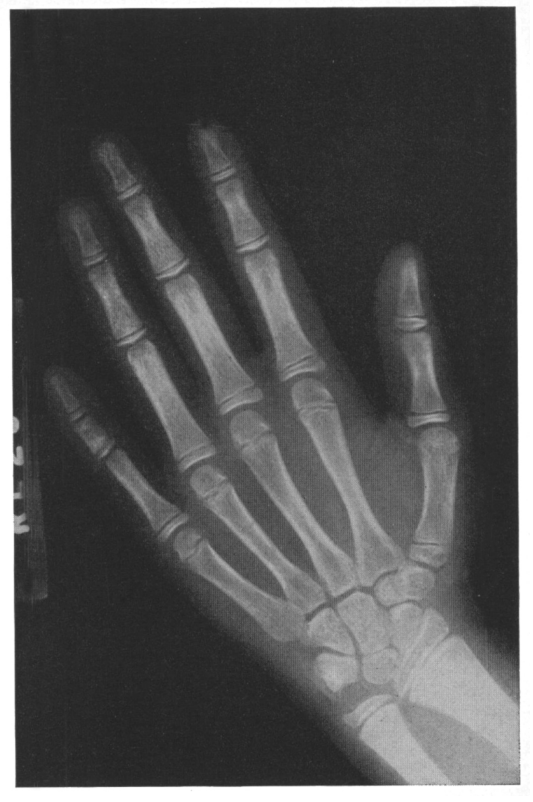
Fig. 2. Cone epiphysis of the fifth middle phalanx beginning union at its apex (Female, age 10)

other Chinese also had ratios of less than 0.50. One of these individuals, 16 years old, had union of all epiphyses and doubtless represents the adult variant of the cone epiphysis type. Another, 10 years old, with the smallest diaphysis of the entire sample, had no epiphysis. The remaining two, with ratios just under 0.50, had the radial side shorter than the ulnar and perhaps represent cases of clinodactyly. None of the 84 Chinese with a ratio above 0.50 had a cone-shaped epiphysis or early union. Two of the 296 individuals in the sample showed other anomalies of the fifth digit, and these were two of the three Chinese early union group. One of these had no fifth distal epiphysis, while the other had a very short fifth metacarpal (Fig. 3).