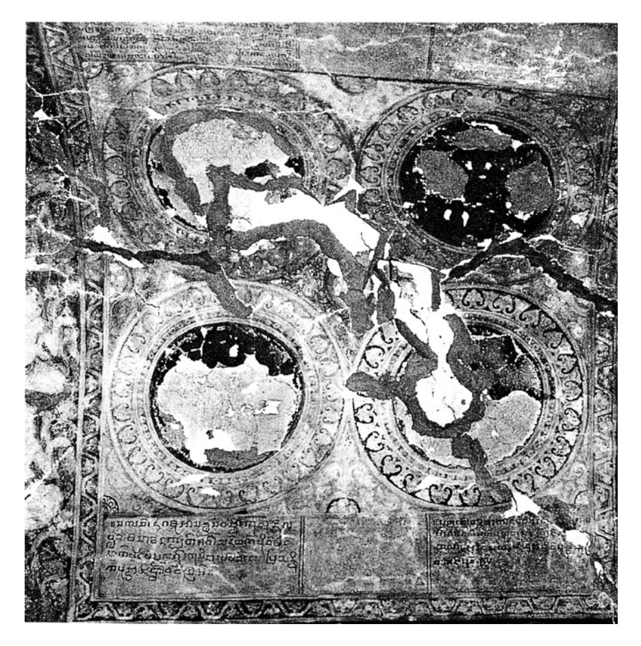
Figure 5. Kutha ink inscription (left part).

As could be expected, the Ajjana era is a similarly rare occurrence. The only examples of its use during the Bagan period come from two short painted inscriptions on the ceilings of temples 845 (Kutha) and 1471 (Theinmazi) at Bagan. Both consist of four horoscopes referring to important events in the Buddha's life: conception (Maya's dream), birth, enlightenment, and parinibban. <sup>26</sup> In the case of the Kutha temple, the readings of the four dates are interspersed with a second inscription describing the 'Buddhist paradise' Uttarakuru (Figure 5). Apart from these two instances, which are directly related to the four 'great' events in the Buddha's life, the Ajjana era was apparently not used for practical purposes such as the recording of a donation.