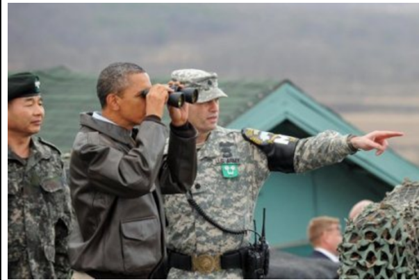
Fig. 1. Obama Peers into North Korea from What He Calls “Freedom’s Frontier” on March 25, 2012.

Korea’s consolidation as a state, registers little, if at all, within the United States where the Korean War is tellingly referred to as “the Forgotten War.” Indeed, few in the United States realize that this war is not over, whereas no one in North Korea can forget it.