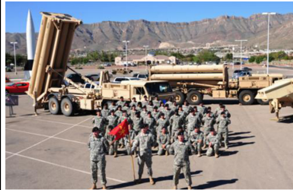
Fig. 5. Red Dawn 2 Redux? Lockheed Martin product page for Terminal High Altitude Area Defense (THAAD).

trigger-happy North Korea has justified the acceleration of the THAAD missile-defense system in Guam, a second U.S. missile defense radar deployed near Kyoto, Japan, the positioning of nuclear aircraft carriers throughout the Pacific, and lucrative sales of military weapons systems to U.S. client-states through the Asia-Pacific region. Albeit all key elements in U.S. first-strike attack planning, this amplified militarization of the “American Lake” is justified by the Pentagon as a “precautionary move to strengthen our regional defense posture against the North Korean regional ballistic missile threat.” 24 As early as June 2009, then-Secretary of Defense Robert Gates, in announcing the deployment of both the THAAD and sea-based radar systems to Hawai‘i, explained, “I think we are in a good position, should it become necessary, to protect American territory” from a North Korean threat. 25 In early April 2013, in a press release announcing its missile defense deployment throughout the Asia-Pacific region, the Pentagon stated, “The United States remains vigilant in the face of North Korean provocations and stands ready to defend U.S. territory, our allies, and our national interests.” 26 Advertised as safeguarding “the region against the North Korean threat,” the X-band radar system, which the United States sold to Japan “is not directed at China,” as U.S. officials were careful to state, but simply a defensive measure undertaken in response to the danger posed by Pyongyang. 27