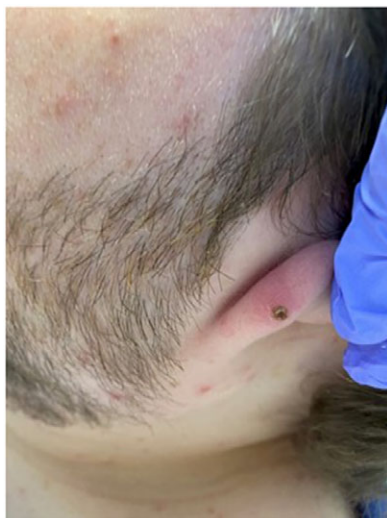
Figure 3. Crusted, vesicular lesion with central necrosis on the left ear lobe.