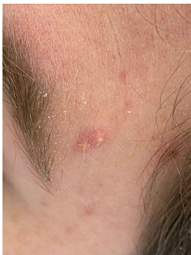
Figure 4. Pustular lesion on the left forehead.