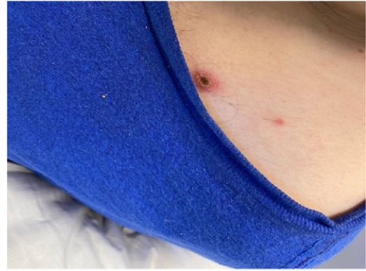
Figure 5. Macular lesion on the erythematous base with central necrosis on the left upper chest.