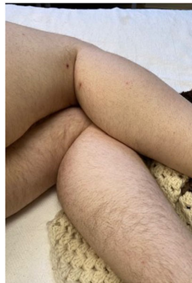
Figure 6. Macular lesions with early central necrosis on the posterior right lower extremity.