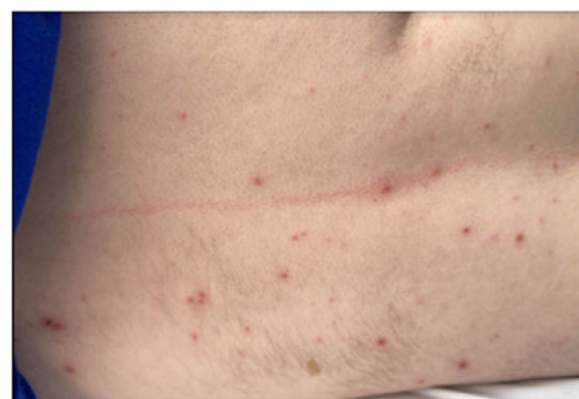
Figure 1. Maculopapular, vesicular, and pustular lesions with central necrosis and early crusting on the back.