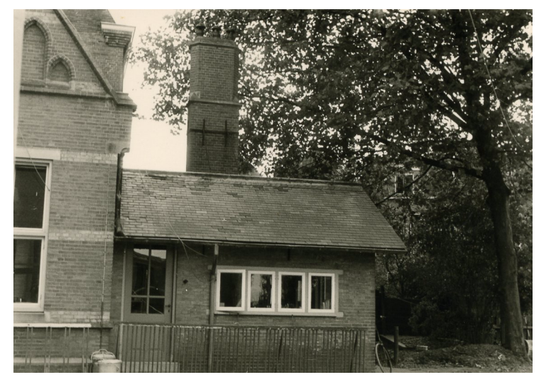
Figure 2 De Vries used this small annex to the Physics workshop for his pioneering <sup>14</sup>C work.

cycle. The approximate size, and exchange rates, between the global carbon reservoirs were known from Harmon Craig's work (Craig 1957) and could be converted into an electric analogue where the reservoirs were presented by condensers and the exchange rates (and <sup>14</sup>C decay) by resistors. A metal sheet, with the sunspot record of the last 400 yr carved on its edge, was mounted on the axis of the motor. While rotating, the edge of the sheet intercepted part of a light beam striking along the edge of the sheet. The light intensity variations were converted by a photomultiplier into electrical current variations, and fed into the model. The current variations provided an "electrical" sunspot curve, and the modified responses of the electric analogue were observed with an oscilloscope. All in all, a far cry from present-day computer modeling, but, fortunately, the results (Stuiver 1961) were equally valid.